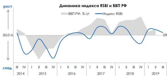
Figure 2 - RSBI for the period 2014 - 2019

Regarding the support to Russian SMEs coming from the entrepreneurial association, the most important Russian business organization for Russian SMEs is the all-Russian non-governmental organization OPORA RUSSIA. OPORA plays a crucial role in the resolution of legal controversies among SMEs and in representation of their interests before the State. Moreover, OPORA also collects specific data about SMEs in order to elaborate important indexes, such as the dynamic index RSBI (Russian Small Business Index) about the performance of SMEs which evaluates business sentiment in three sectors: trade, production, and services [51]. An index value above 50 points means an increase in business activity, below 50 - a decrease. An index of 50 points indicates a stagnation in the market. The trend of RSBI, as reported in figure 2, shows an overall stagnation of the SMEs activity for the period 2014 - 2019.