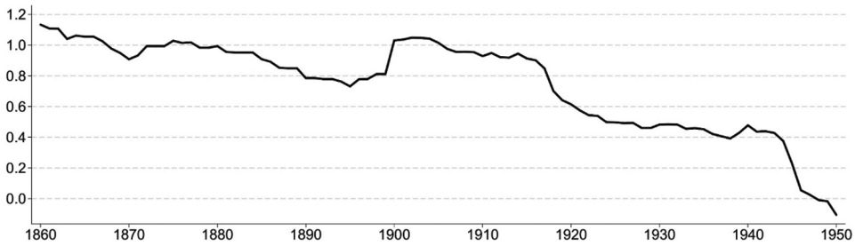
Figure 2. Global trends in political exclusion of the poor, 1860–1950.

unequal distribution of political power across economic classes. Consistent with our main hypothesis, we expect this variable to share a positive relationship with social-revolutionary terrorism.