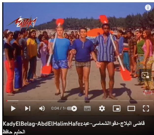
Figure 1. ‘Abd al-Ḥalīm Ḥāfiẓ pleading for his status, in “Qāḍī al-blāğ”, 1969 (0’04)

In an Egypt suffering the bitter defeat of 1967, whose repercussions in the national memory and political field are well known, 22 the representation of Egyptian youth cannot express envy or emulation of the young people