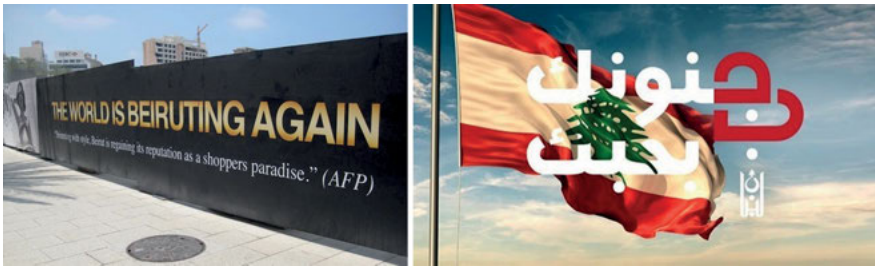
Fig. 3: (Re-)branding Beirut

Middle East,” stemming from its banking and entertainment industries, art scene, tourism potential, and variegated landscapes. 228 This image already singled Lebanon out as an exceptional Arab nation, but was repeatedly tarnished by periods of war and unrest. With its immense downtown reconstruction project after the civil war (1975–1990), Beirut aspired to modernise and develop into a “Hongkong on the Mediterranean.” 229 The city recovered, was in large parts remodelled according to neoliberal urban planning, and has become another paradigmatic case of post-modern urbanism. While its cosmopolitanism and Westernisation are promoted by entrepreneurs and the state to attract business and, in particular, tourism, this contrasts with the image of sectarian strife that still marks post-war Beirut, as it is publicly reflected in the personality cult around sectarian leaders and in public rallies that brandish portraits of martyrs, flags, and insignia as emblems of collective identities. In the 2000s, the Ministry of Tourism made great efforts to rebrand the country and to encourage Arabs and Westerners to fly in for visits. New large urban development projects were widely advertised with slogans such as “Beirut is back on the map” or “The World is Beirut Again” (Fig. 3a).