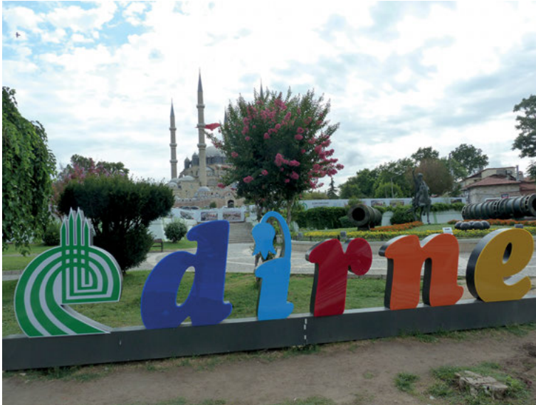
Fig. 4: Welcome Edirne city logo with the Selimiye Mosque in the background

entered this battlefield. In contrast, Pekka Tuominen’s chapter explores the question how the local population conforms with, resists, or appropriates official urban brands in a more central and more secular neighbourhood.