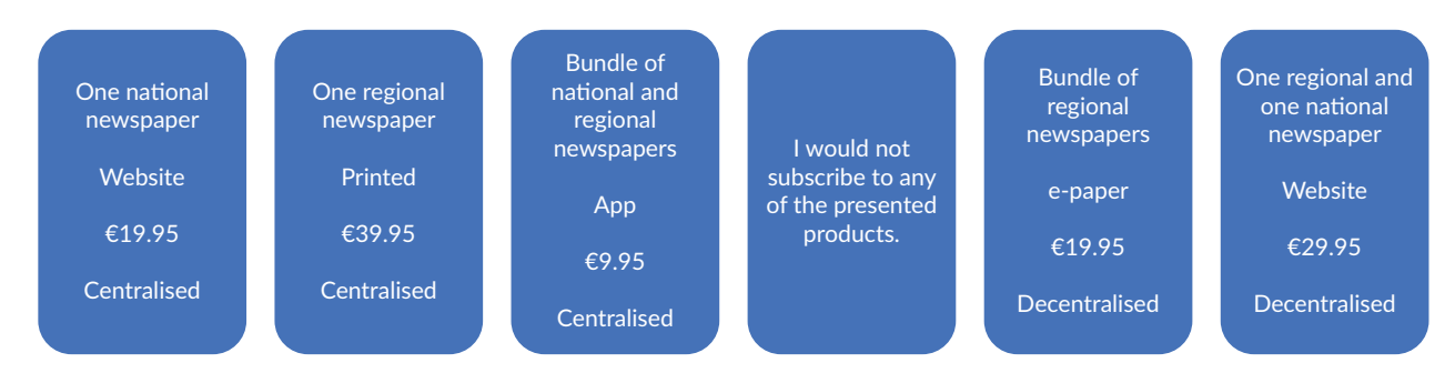
Figure 2. Exemplary presentation of the possibilities of choice in CBC.

The utilities derived from respondents' choices were used to evaluate how attribute levels impact market share in simulated market scenarios. These simulations allow us to predict respondent behaviour in various market