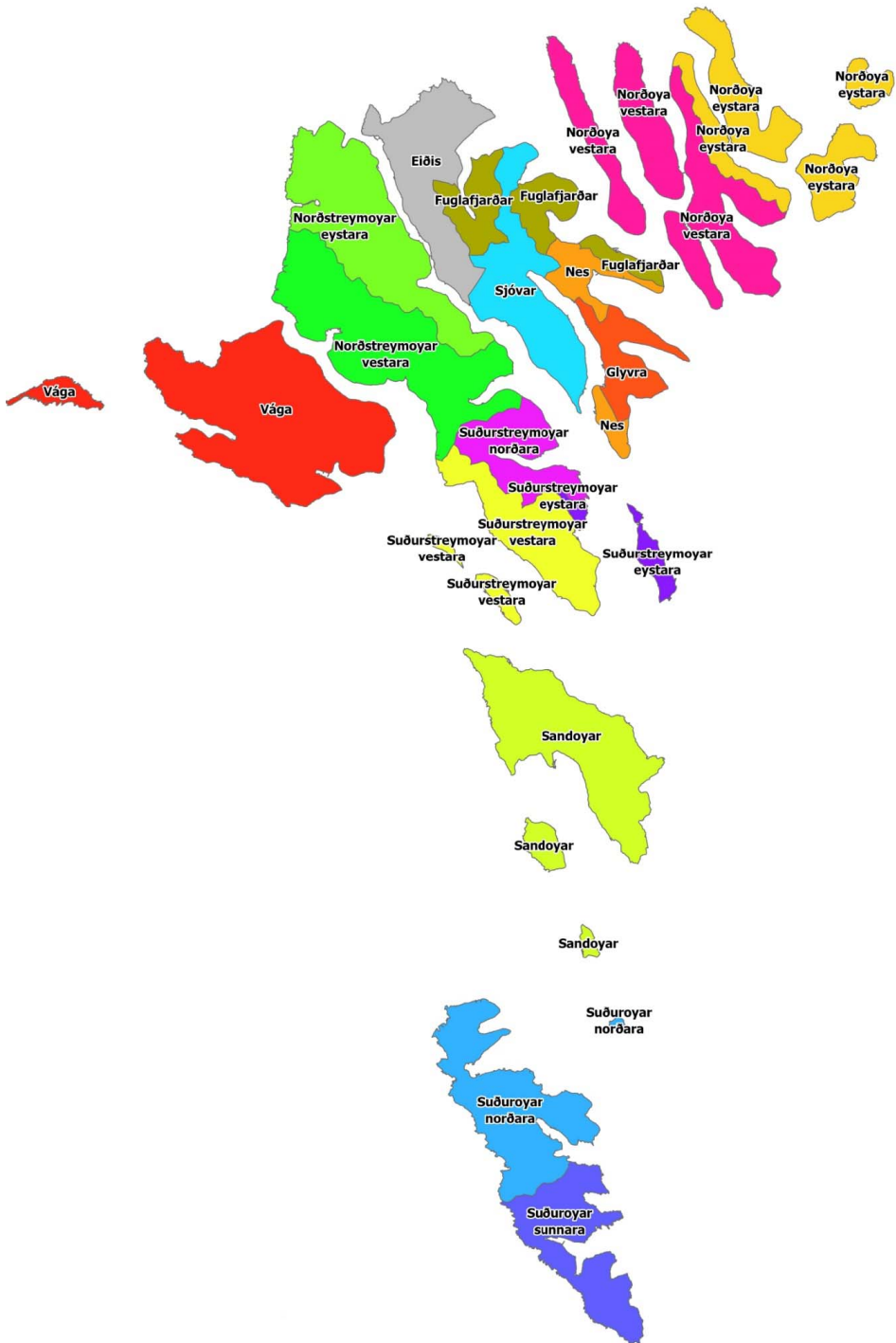
Fig. 2. Church administrative division of the Church of the Faroe Islands 1