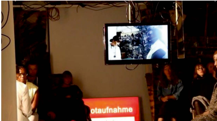
Fig. 4: The moment of "interrogating" the patient.

Although he speaks only in order to voice his opinion on the consequences of anti-psychotics on his body, his silence equally communicates nostalgic feelings that translate into resilience and revolt not only against an individual, but correspondingly against a system that,