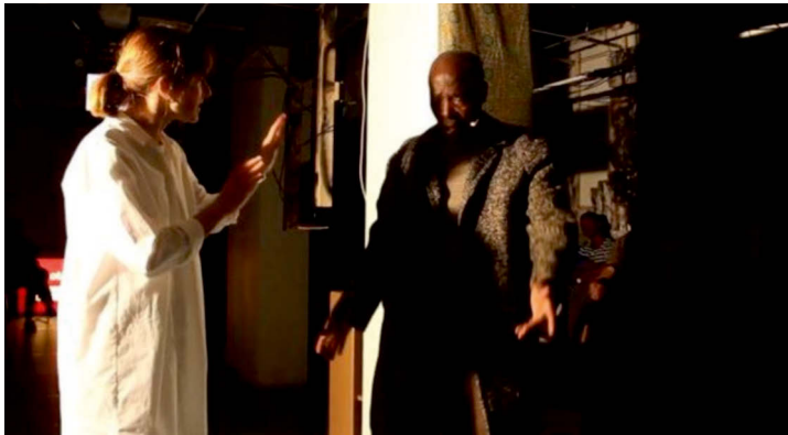
Fig. 5: Confrontation between the medical doctor and the artist.

thority and even more so because her encounter with an elderly African man on this space becomes the dominant discourse in the entire narrative of the performance. The emerging power dynamics at the hospital scene locate the doctor and her profession on a privileging spot that seemingly guarantees her control over the space and over her interlocutors.