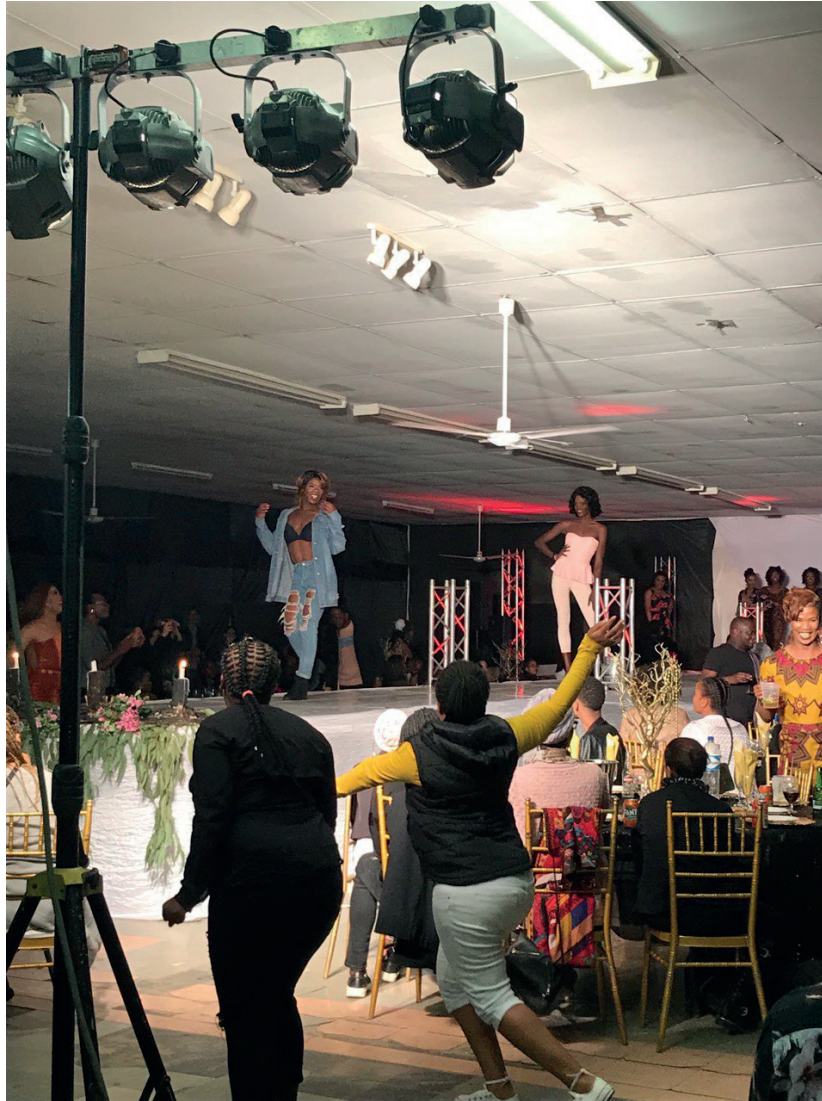
Fig. 1: At Miss Transgender Ambassador 2019 : The crowd runs closer to the stage after recognizing a special song during the performance.

country-wide known LGBT* 1 -activists, questions such as “What does womanhood mean to you?” or “Which role does education play in the LGBT*-community?”.