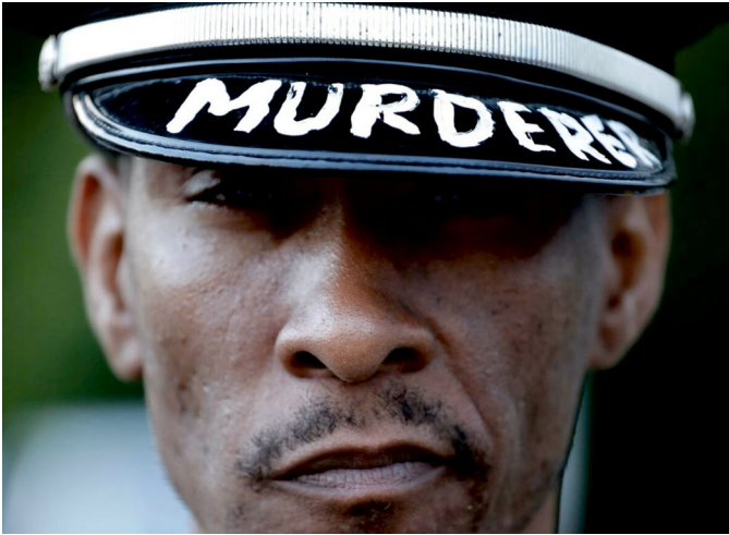
Figure 1: Police Shooting Missouri, Aug. 7, 2014