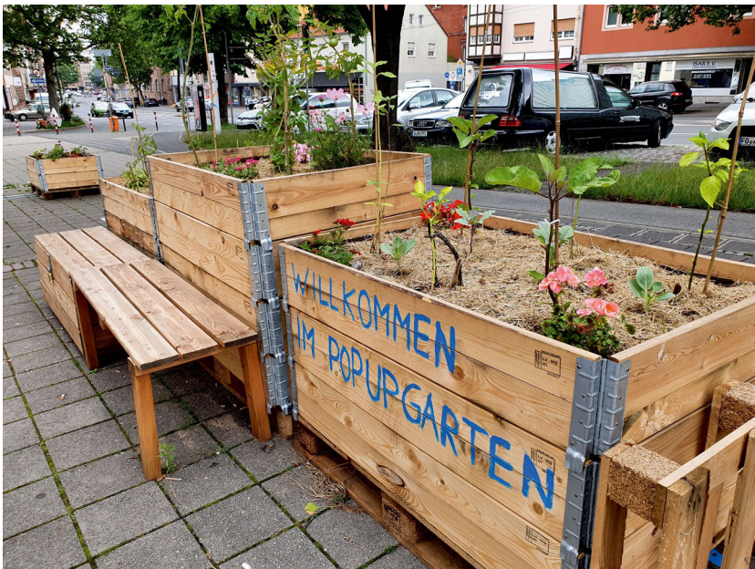
Abbildung 1: Pop-Up Garten in der Nürnberger Südstadt

Eine wichtige Rolle in solchen Community Building und Organizing Prozessen können Kirchen und Religionsgemeinschaften spielen. Sie können, auch dank ihrer räumlichen und zeitlichen Stabilität, zu einem Nukleus im Viertel werden, an dem sich Projekte einer gemeinsamen Nachbarschaft anlagern. Zugleich bieten Kirchen und Religionsgemeinschaften als organisierte Gemeinschaften ein über Jahrzehnte, wenn nicht Jahrhunderte gewachsenes Feld reichhaltiger Konzepte von Community – hier seien exemplarisch die Begriffe (christliche) Gemeinde und (islamische) Umma genannt –, an das das Community Building anknüpfen kann. Zudem können beispielsweise die christlichen Kirchen auf ihr Engagement im Community Organizing, beispielsweise durch Leo Penta in den USA, verweisen. Und schließlich existiert eine lange Tradition praktizierter Solidarität und Gastfreundschaft mit migrantischen Neuangekommenen in der Stadt.