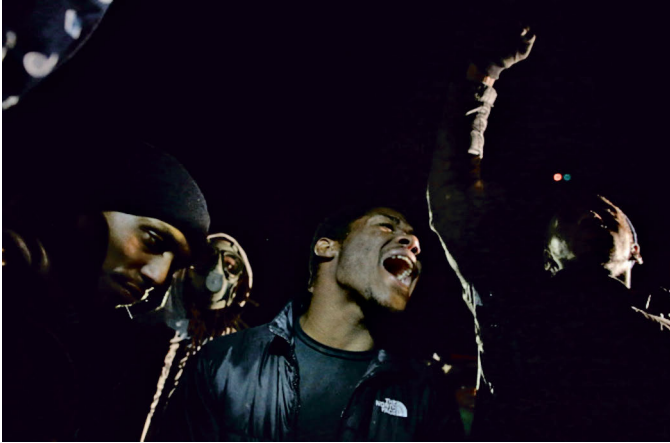
Figure 2: Screaming Man Protesting. November 25, 2014, Ferguson, MO