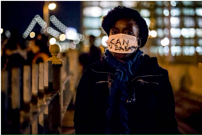
Figure 3: A female protester, demanding justice for Eric Garner, sports a face mask in Brooklyn, New York, Dec. 5, 2014