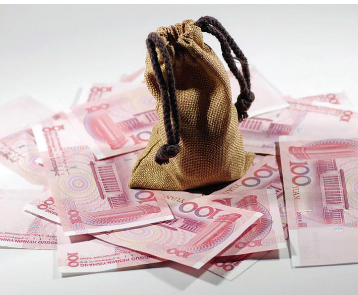
In multilateral cooperation, the parties can form a pool from which the joint projects are funded based on merit, or a "fair return" principle can be adopted. (Chinadaily, 2021)

The Asia-Pacific Space Cooperation Organization (APSCO), established in 2005 as an inter-governmental organization (Yan 2021), may serve as an example, and conclusions can be drawn from the experience. It was not established in the context of BRI, but it is still relevant as an example, and the definition of the geographic extend overlaps considerably with the BRI countries. The working principle of APSCO is similar to that of ESA. The contribution of a