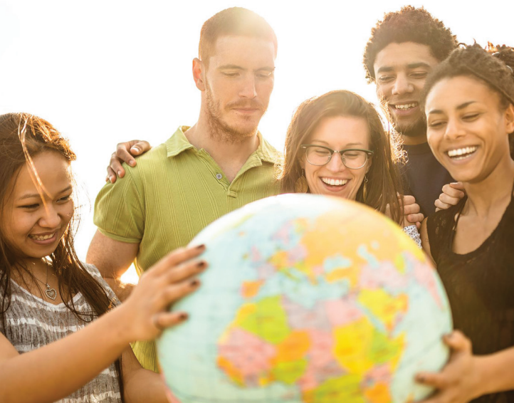
A common language is an accelerating factor in international technological collaboration. (CGTN, 2018)

The language diversity among the BRI countries can be an important roadblock. One large cluster in the area is the former Soviet countries group in which Russian was the lingua franca, and higher education was mostly in Russian. Although Russian is still spoken by most of the educated people, the number of Russian speakers is decreasing in non-Russian countries (Pavlenko 2008). China is promoting Mandarin Chinese via scholarships in China and other mechanisms. For example, Masood (2019) explains how Mandarin becomes an optional language choice in Pakistan. However, Chinese is very far from being the lingua franca of BRI. The obvious choice is English for cooperation programs for the foreseeable future. Although the existence of former British colonies in the region like India and Pakistan is facilitating this option, the proportion of English speakers as a second language is very low in most of the area, including Central Asian countries.