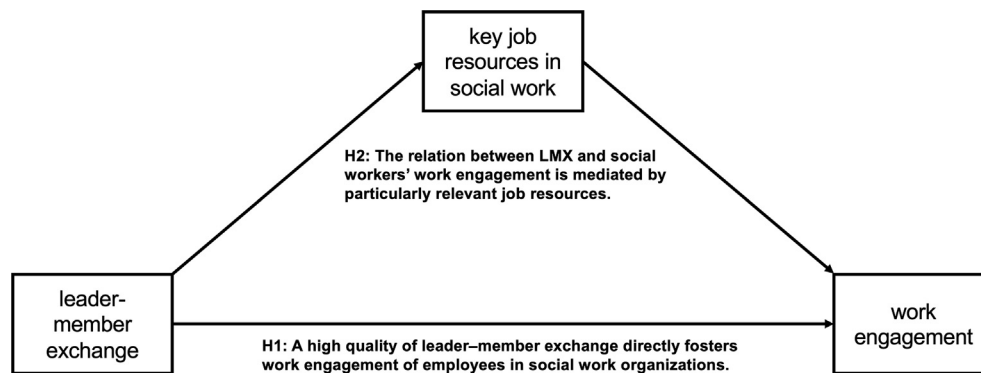
Figure 1. Conceptual framework.