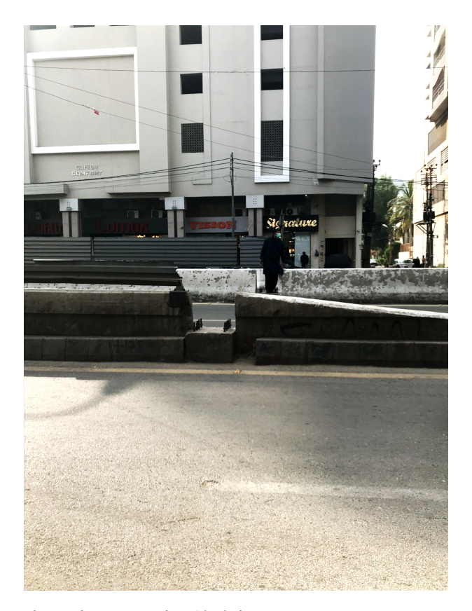
Figure 4. Walking pathways through gaps at the Gizri flyover.