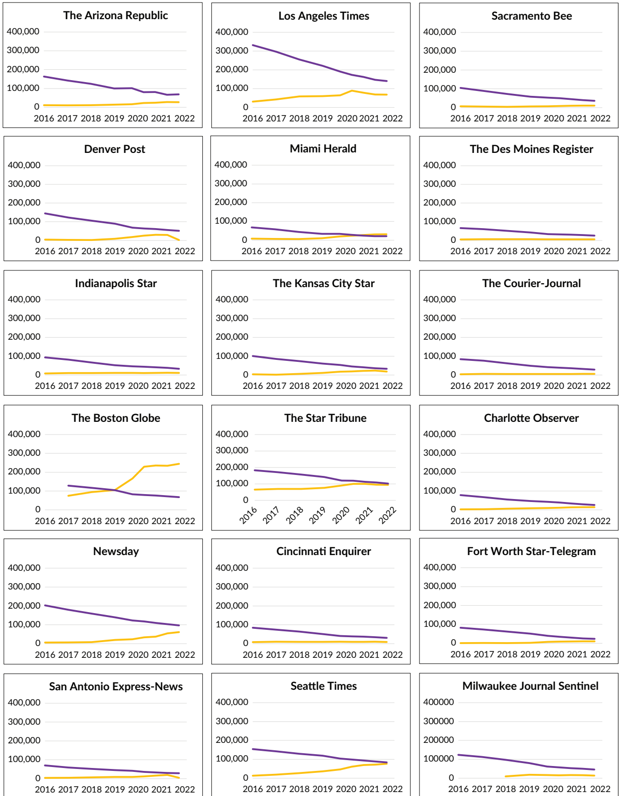
Figure 1. The print-digital circulation gap before and during Covid-19. Note: The purple line depicts print circulation (source: Table 2); the yellow line depicts digital nonreplica circulation (source: Table 1).