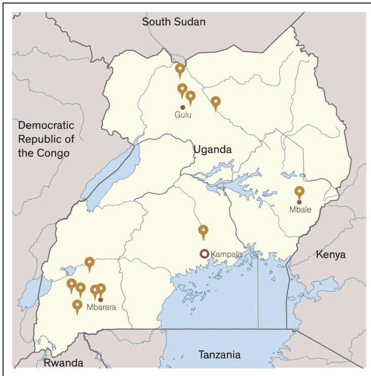
Figure 1. Map of Uganda With Main Field Sites.

and forty youth who were not. Of those who were part of a development scheme, the names of twenty were originally provided to us by a donor.