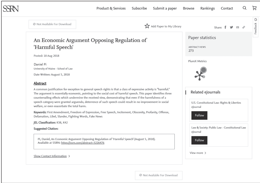
Fig. 2. Article from SSRN Repository