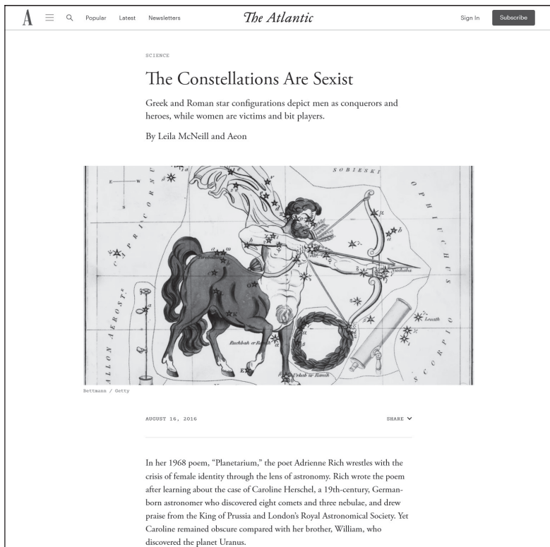
Fig. 3. Article from the Atlantic