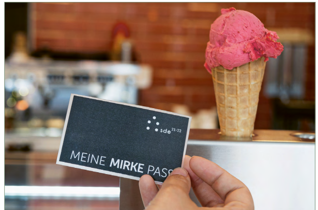
Fig. 1: Meine Mirke Pass.

All households (approx. 4,000) in the Mirke neighbourhood received a postal invitation to the neighbourhood panel from the City of Wuppertal in April 2021. A total of 1004 people accepted the invitation and registered for the Mirke neighbourhood panel in the recruitment phase. Just under half (461 people; response rate: 45.9%) took part in the first survey in September 2021. This response rate is slightly higher than average (Wu et al. 2022). In the second survey wave in April 2022, 390 people took part (response rate: 38.8%). In the third survey wave in August