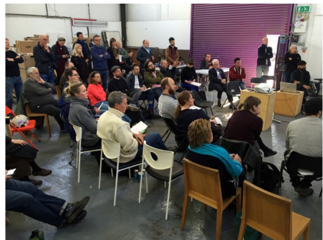
Figure 9. Flyers handed out by student researchers during audits (left) and first meeting of Vital OKR (right).