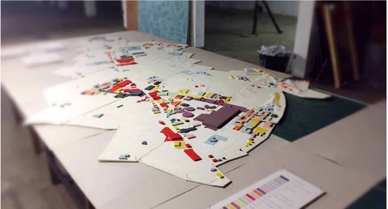
Figure 1. AAD Cities’ model of the OKR OA, with different economic sectors in various colours, shown at the Livesey Exchange Exhibition as part of the London Festival of Architecture (LFA), 2017.

The findings of all the audits are reported elsewhere (AAD Cities, 2016, 2017, 2018; Clossick & Brearley, n.d.).