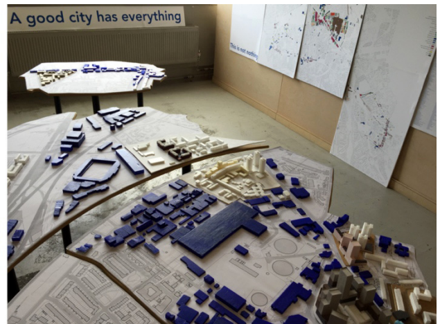
Figure 2. AAD Cities’ exhibitions of OKR Audit findings at Asylum Chapel, Southwark, 2016 (left) and at Central House, Tower Hamlets, 2017 (right).