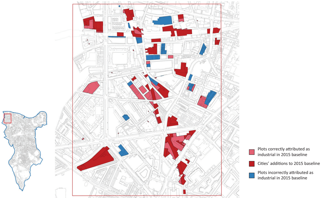
Figure 5. Sample area analysis from the Southwark Industrial Audit, correcting the baseline used for the projections by AECOM et al. (2015) and CAG Consultants (2017).

is an intimate act which can lead to the development of deeper social connection and trust. Local communities may be more likely to engage in capacity-building when they build trust among one another and with the research team during auditing.