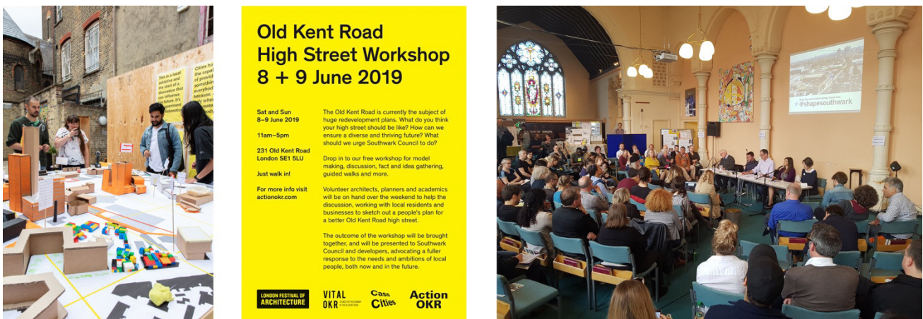
Figure 3. Planning Action OKR workshop at the Treasure House OKR, 2018 (left,); poster for LFA workshop at 231 OKR, 2019 (centre); and Shaping Southwark Hustings, 2018 (right).

Promoting also came in the submission of consultation responses. Representations were made on behalf of the AAD Cities Research Group from London