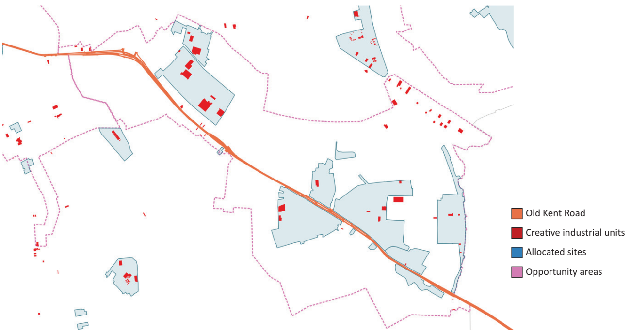
Figure 7. Creative industrial units around OKR in the context of allocated sites in The Southwark Plan (2022) and the outlines of the OAs.

Revealing counteracts the typological problem of “inward-looking” industrial urban form, which hides what is within. Local industrial economies tend to be undervalued, as they are situated in “urban depth” (Clossick, 2017), and in the OKR in particular there are often inward-looking industrial estates that are not integrated with their surrounding urban fabric (Ferm et al., 2021). Physically concealed from view, ways must be