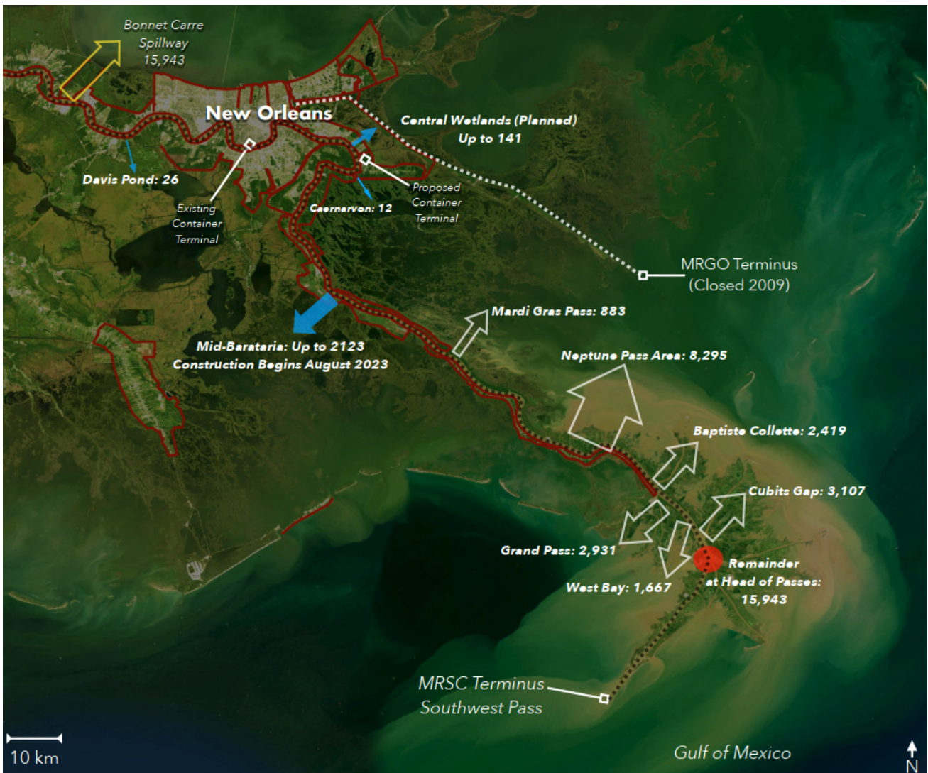
Figure 1. Porosities along the MRSC during the 2019 flood. Notes: The black dashed line shows MRSC; the white dashed line shows the route of Mississippi Gulf Outlet (MRGO); the red lines show flood protection levees; the yellow arrow shows flood control spillway; the white arrows are naturally occurring channels or outlets; the blue arrows are existing and planned coastal restoration projects; the arrow size represents approximate relative flow rates; the red dot indicates Head of Passes; all flows in cubic meters/second; the water losses were measured on March 10, 2019, during a maximum flow scenario below Bonnet Carre Spillway (40918 cm/s at Tarbert Landing).

waterborne transportation. The disturbance regime concept is intended to capture the varying ways that the frequency and magnitude of disturbances like floods, fires, and droughts undergird broad-scale ecological patterns (Turner, 2010). For example, levees designed to prevent overbank flooding along the MRSC deprived deltaic wetlands of freshwater and sediment input, contributing to staggering rates of land loss and compromising ecosystem function and resilience in the region (Edmonds et al., 2023). This demonstrates how infrastructural zones can modulate disturbance regimes, altering the historical range of variability that previously determined landscape-scale environmental dynamics. In response to the unintended consequences of these changes, hydrocracies are being called upon to implement so-called