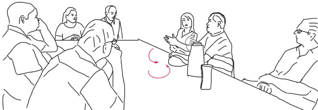
Figure 1. Pablo draws a circle in the air, pointing his hand toward the co-present participants.

12 PABLO: arif. ja- ja: säger också kultur (0.9) e: (1.3) arif. I- I: say also culture (0.9) u:h (1.3) 13 de er (0.4) e::: vi måste ha:: medveten, it is u:::h we must ha::ve awareness, 14 (0.5) 15 PABLO: medveten e:: (0.9) att- a: byta. att byta, awareness u:::h (0.9) to- u:h change. to change, 16 att byta::: (0.8) nya::: (. ) nya::: (0.7) to change::: (0.8) new::: (. ) new::: (0.7) 17 nya (odlar). new (cultivates). 18 ARIF: a. a. yeah. yeah. 19 PABLO: nya sak. new thing. 20 ARIF: a. a. yeah. yeah. 21 PABLO: a:: att att ha: e:n en bra liv. yea::h to to ha:ve a: a good life . 22 *#(0.6) en bra:::* (0.5) sa:- samhälleç (0.6) a goo:::d (0.5) so:- societyç pablo *draws a circle with right hand* #Fig.01 23 ARIF: mh. 24 (0.6)