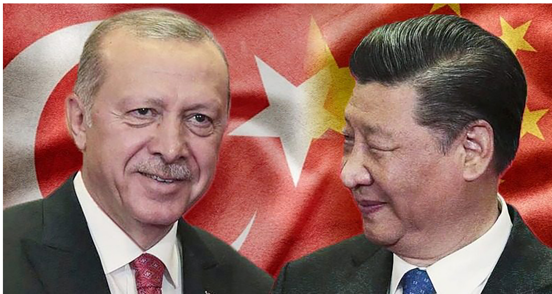
China-Turkey relations are normalizing thanks to the leadership of the two heads of state. (United World, 2019)

and the image of Turkey in the eyes of the Chinese people. The third part explores the possible reasons behind these diverging perceptions. The article will conclude with a section that proposes suggestions on how to improve the image of each other.