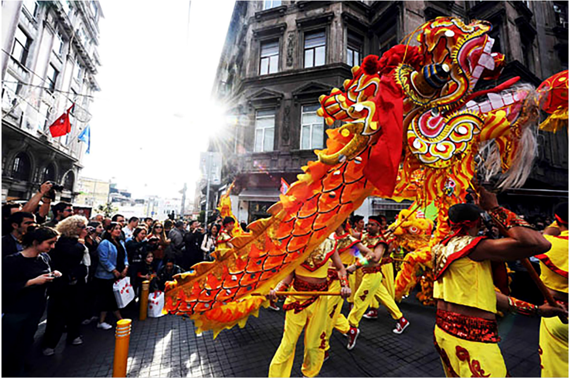
Traditional Chinese dragon dance is held in Istanbul in the Year of Chinese Culture. (China Daily, 2012)