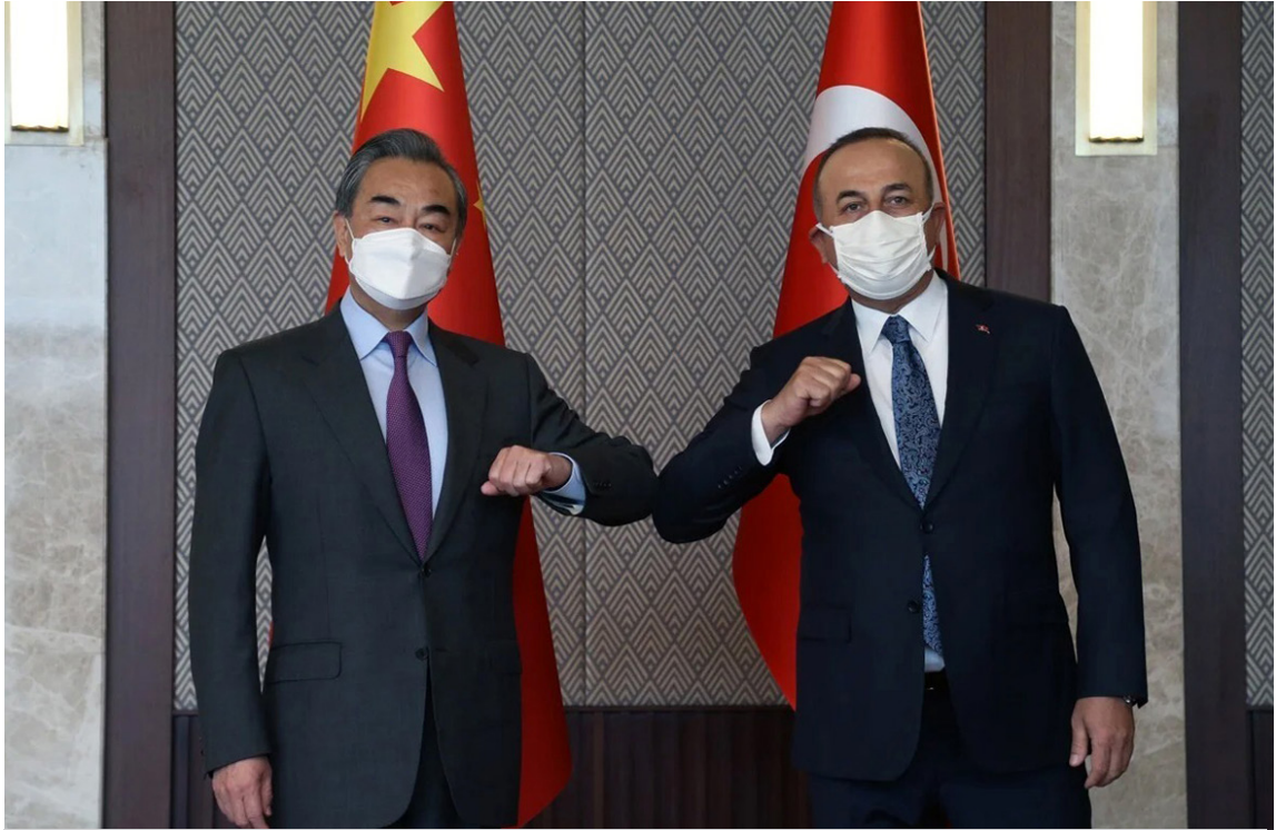
Meeting with Chinese Foreign Minister Wang Yi within the framework of the 50th anniversary of our diplomatic relations.

The second is “romance”. In the Chinese imagination, Turkey is a romantic place with excellent geography and scenery. Just mentioning names, like the Mediterranean Sea, the Aegean Sea, and the Bosphorus Strait, will arouse clear visions and longing in the Chinese. That’s why the song “Take You to Romantic Turkey” is so popular in China.