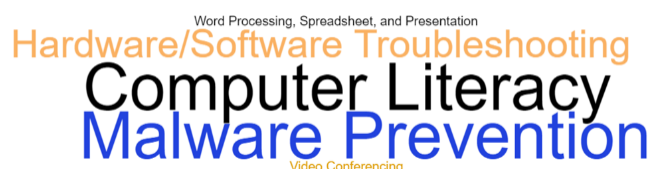
Figure 1 – Word cloud of the suggested extension activities

The Extension Projects and Activities Needed. The conduct of the technical assistance has opened opportunities for faculty extensionists to extend other activities and services for the betterment of the institution. From the results of the analysis of the participant’s responses, they have mentioned the following activities as needed: Seminars on computer literacy; orientation to hardware and software troubleshooting; prevention of malware; seminars on Google Sheets; innovation and improvement of IT systems; and seminars on Google Meet Figure 1 presents the word cloud of the most sought-after extension projects to be conducted by the faculty extensionists in the organisation.