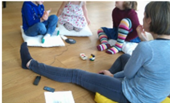
Figure 6: Using playmobile instead of role play [40]

Even when using the situation cards as an alternative to the role play, children often imitated parents' voices. In one instance, we changed the role play with the moderator playing the child to using playmobile figures (see Figure 6). Even though children did not play a parent, they still articulated what they thought a parent would say, potential consequences, general rules, and sanctions. However, if children engaged in the human role play, we found more interaction than in the role play with figures. In our experience, it was good to have alternatives to give the moderator flexibility to decide what was best suited for the individual group and for the moderator in that situation.