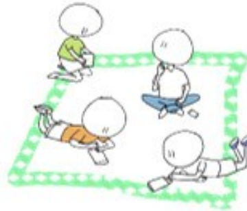
Figure 2: Scenario Card 1

have a mouth. Not having hair also left interpretations of the characters' gender open and thus open for diversity.