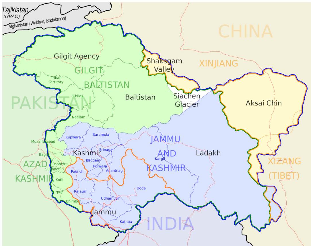
Figure 1. Map of Kashmir.

popular notion of state in Kashmir (rather than a protector and provider of security) is perceived as a perpetrator of zulm —reflective of the exercise and popular experience of repressive structures and procedures by the state (Mir, 2021, 2022). As a site of active contentious politics challenging the legitimacy of the state, it has kept hold of the region through militarised authoritarian regimes. In order to maintain a hold over the territory and survive through popular contentious politics, the regime militarily micro-regulated the physical and social spaces and bodies contained within them becoming reflective of militarised authoritarian control (Mir, 2021). Both militarised authoritarian regimes and militarised authoritarian control are used in a similar sense. While the militarised authoritarian regime flags the process of foisting repressive structures and procedures, militarised authoritarian control is used to reflect the manifestation of that in daily popular lives.