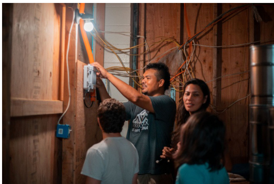
Figure 2. Pu’uhonua o Waimānalo community network installation during the 2018 Indigenous Connectivity Summit.