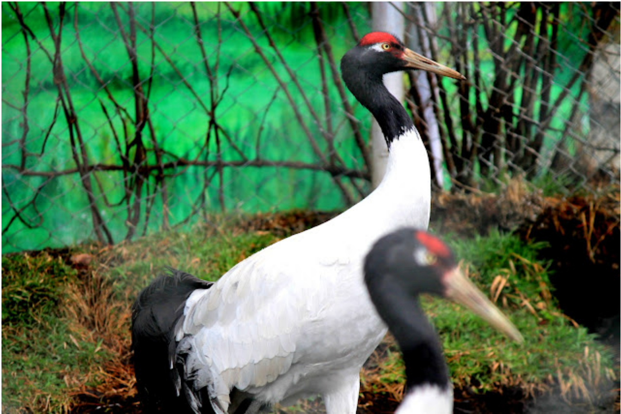
Image Attribute: A pair of Black-Necked Crane at Black-Necked Crane Center in Phobjhika Valley (March 2023)