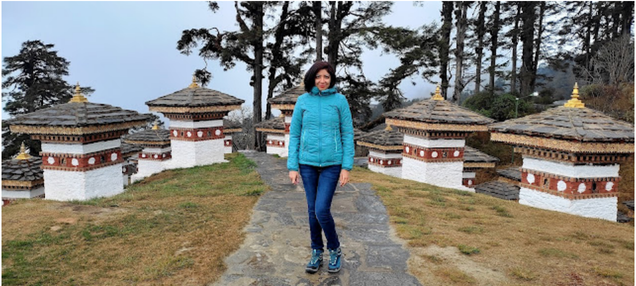
Image Attribute: Author at Dochula Pass (March 2023)