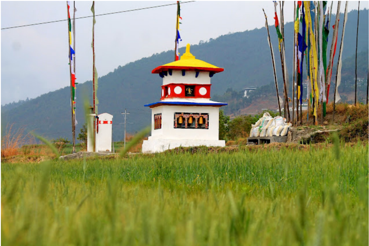
Image Attribute: Paddy field, near Chimmi Lakhang (March 2023)