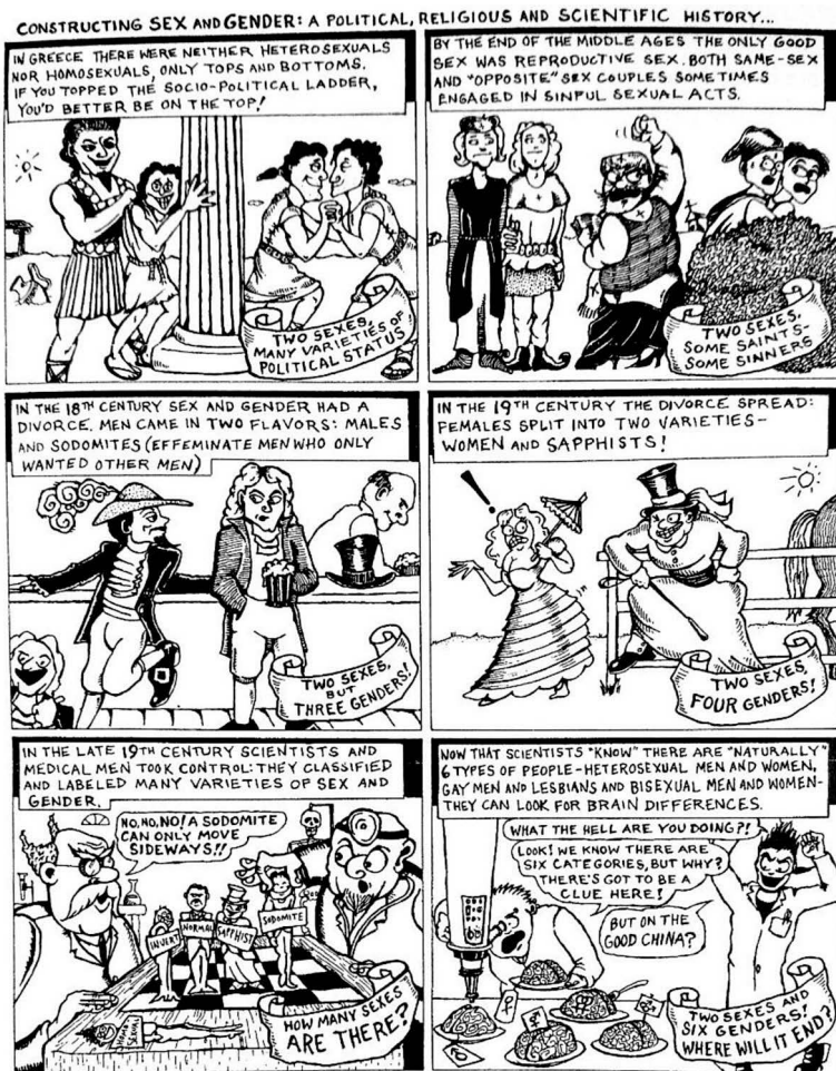
Figure 1: "Constructing Sex and Gender: A Political, Religious and Scientific History..."

in Fausto-Sterling's Sexing the Body illustrates that homosexuality has been constructed differently at various periods in time. 40