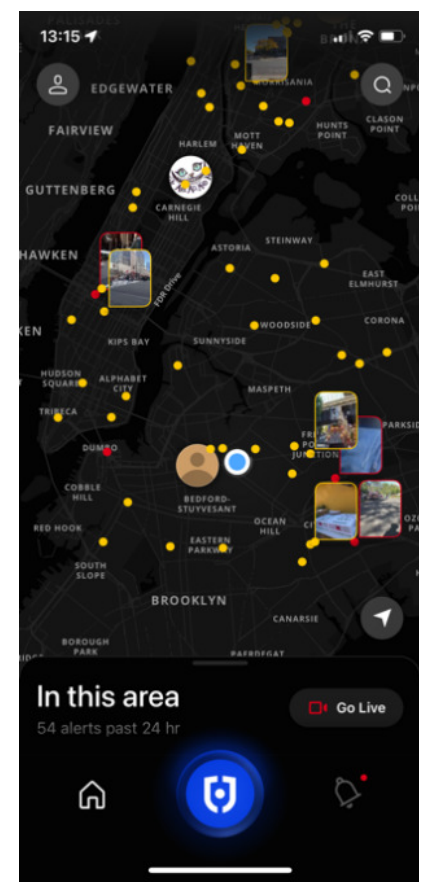
Figure 2. Citizen map.