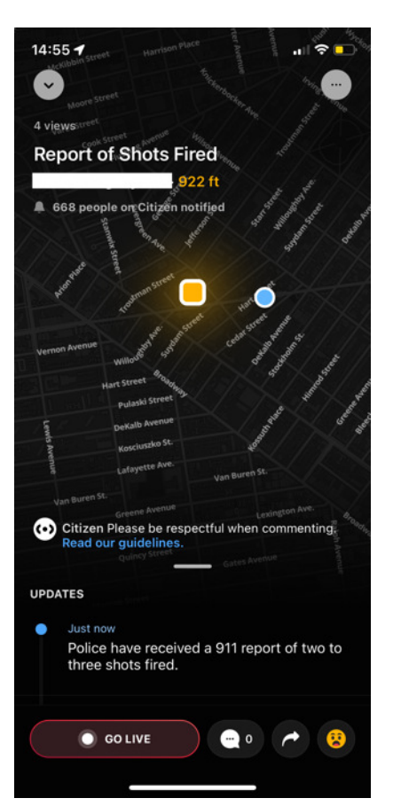
Figure 1. Citizen incident.

Citizen is currently in 60 different US cities and boasts 10 million active users as of 2021, 2 million of which are reportedly in New York City. Its founder and CEO Andrew Frame made millions moonlighting for fledgling Facebook and was previously arrested by the FBI for hacking NASA as a teenager (Bertoni, 2019). According to Crunchbase, Citizen has amassed $133 million in funding from multiple venture capitalist investors, including