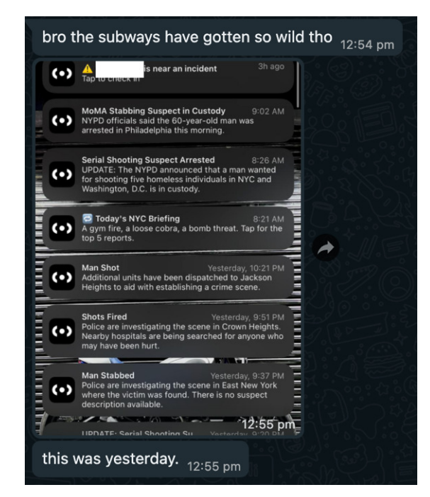
Figure 4. Screenshot of Z's messages about Citizen notifications.