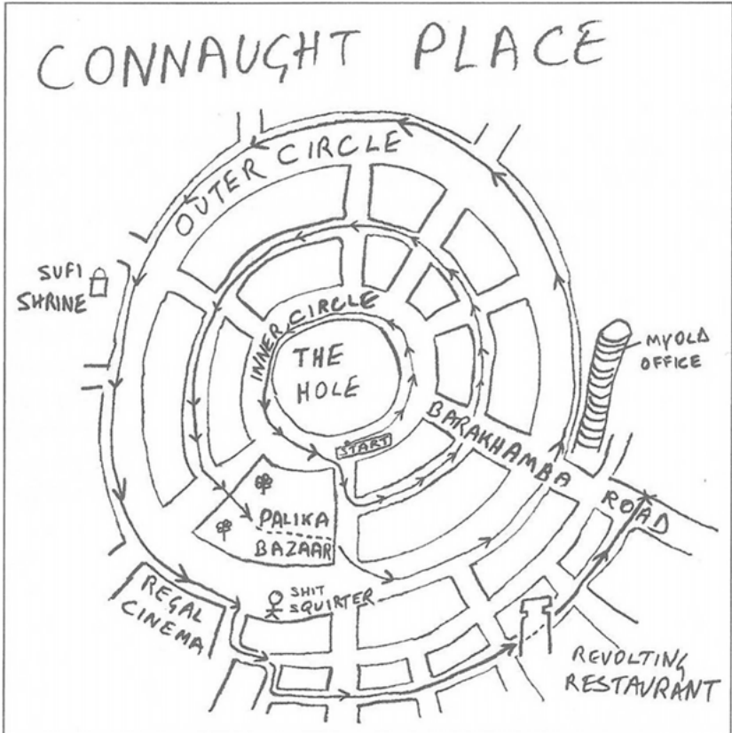
Image 3: Hand-drawn map of the centre of Miller’s spiral - Connaught Place in Delhi as “The Hole”