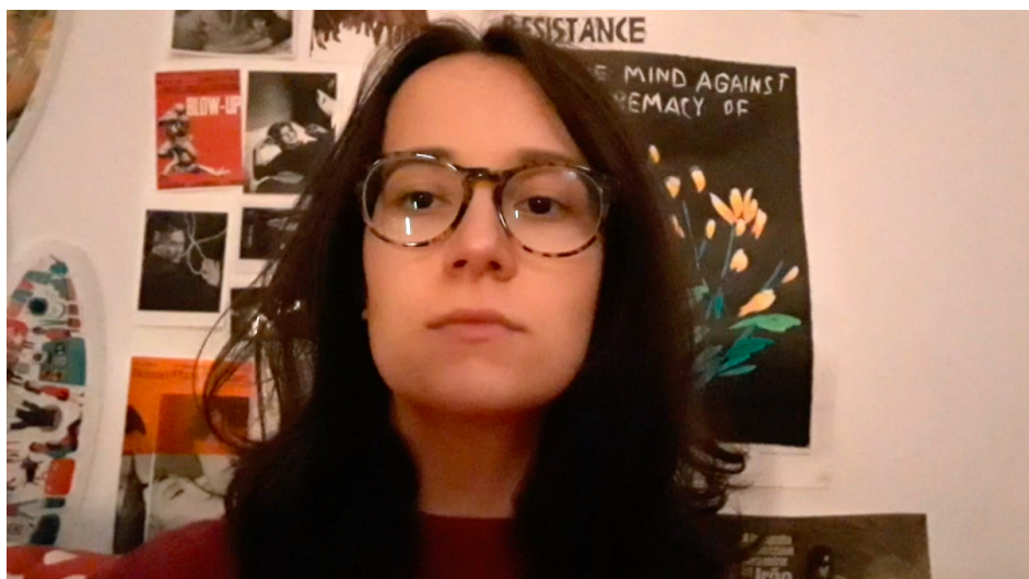
Figure 2. Film still from “From Here and There.”

This means that assuming digital mediation not as a transparent border of mediation but as an experience in itself, as “the analysis of forms of interaction with other people and the surrounding environment today cannot disregard the many forms of interaction with the media devices inhabiting our everyday spaces and structuring our everyday practices and gesturality” (Ugenti, 2021, p. 179). Thus, for the interaction between media, the