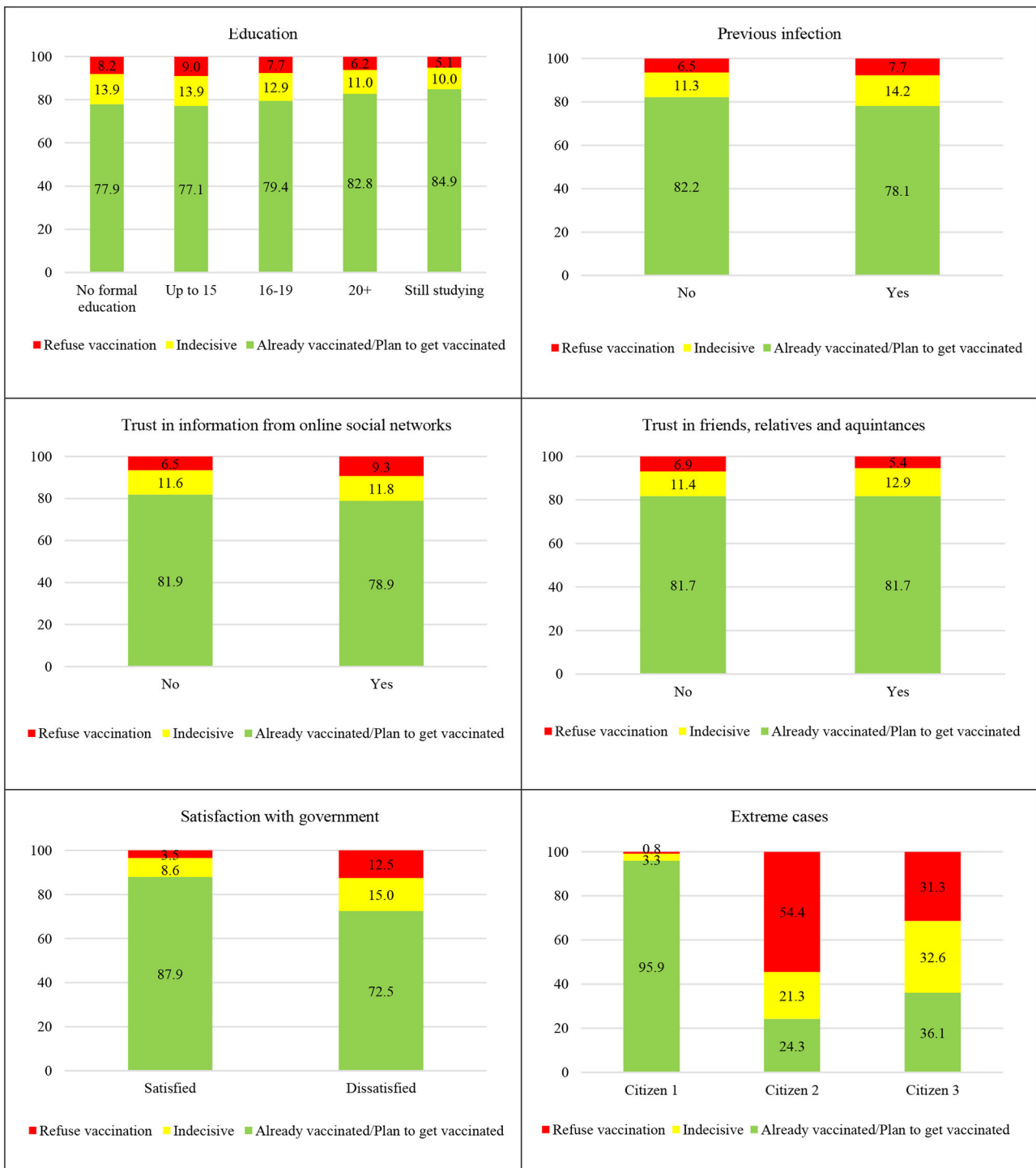
FIGURE 3 | Predicted probabilities by different criteria, %. (1) Panels 1–5 illustrate how the change in the observed variable affects the predicted probabilities for an average EU citizen. (2) Panel 6 shows the predicted probabilities in the extreme scenarios. Citizen 1 —was not ill because of COVID-19, but knows people who were seriously ill; satisfied with the way government has handled the vaccination strategy (including the transparency issues); does not rely on friends, relatives, media, or online social networks when seeking information on COVID-19; does not think she/he can avoid infection without vaccination; still studying. Citizen 2 —was ill because of COVID-19, but does not know people who were seriously ill; dissatisfied with the way government has handled the vaccination strategy; relies on media and online social networks when seeking information on COVID-19; thinks she/he can avoid infection without vaccination; finished education by the age of 15. Citizen 3—was ill because of COVID-19, but does not know people who were seriously ill; dissatisfied with the way government has handled the vaccination strategy; relies only on friends and relatives when seeking information on COVID-19; thinks she/he can avoid infection without vaccination; never had formal education. Source: Author’s own calculations based on Flash Eurobarometer 494.