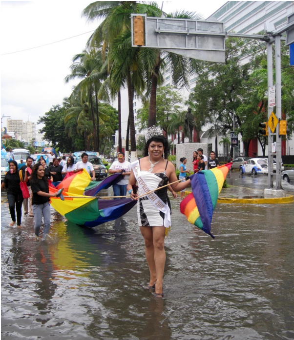
Figure 5. Acapulco’s annual Pride march.

At the same time, Guerrero is cited as having more killings of sexual and gender minorities than any other political entity in Mexico except Veracruz and Mexico City, which both have populations nearly triple the size. The complicated stories told by the research subjects of this study and indicated by other experiences suggest three frames that together help us understand the set of dynamics that matter for members of the LGBTTTIQ community in Guerrero: liberation, exploitation, and violation.