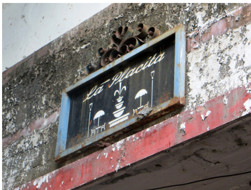
Figure 3. Decrepit sign above La Placita restaurant adjacent to Acapulco’s Zocalo.