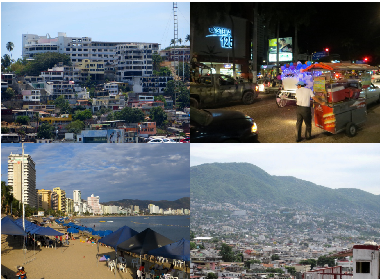
Figure 1. Scenes from the tourist zone of Acapulco in the present day.

Following this introduction, Section 2 provides a re-examination of scholarly literature about queer tourism in relation to the study at hand. In Section 3, I summarize Torres Arroyo's analysis of the unfolding of Acapulco from a small port town to one of Mexico's most popular tourist locations, even amidst high rates of homicide. Section 4 provides a selection of reflections drawn from a set of interviews concerning the dynamics of sexual and gender minorities in historic and contemporary Acapulco, contemplating the high level of violence and impunity that impacts sexual and gender minorities. These complicated stories of exploitation, violation, and at times liberation combined with those of emergent dominance of organized criminality, illustrate the effect of socioeconomic segregation on the intersectional lives of members of the LGBTTTIQ community (cf. Irazábal & Huerta, 2016). These interviews, a subset of a larger set of conversations that are part of a project examining violence against queer and trans persons in the state of Guerrero, help illustrate the relationship between tourism, queerness, and the socioeconomic segregation that Torres Arroyo (2017, 2019) describes.