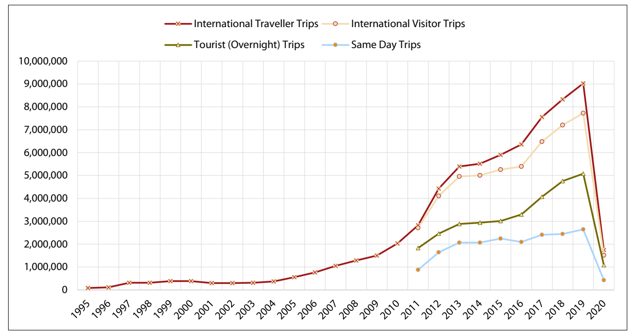
Figure 3: International Trips to Georgia 1995–2020