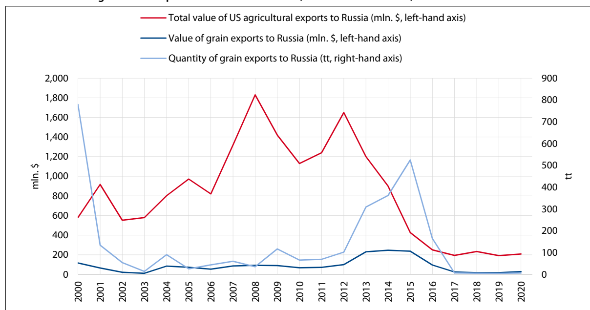
Table 1: U.S. Agricultural Exports to Russia after 2000 (dollar values are USD) a