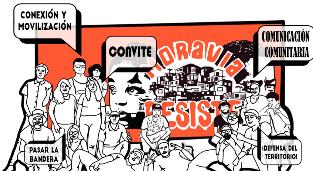
Figure 3. Moravia Resiste Collective.

The conversations with the members of Moravia Resiste highlighted the intergenerational dynamic of the collective. Moreover, it was important to understand the mobilization strategies through their trajectories of communication dynamics, places, activities, and even objects (the bicycle and the megaphone, the pot and the spoon, the audio mixer, etc.). Thus, the co-creation process needed to allow for collective stories to emerge.