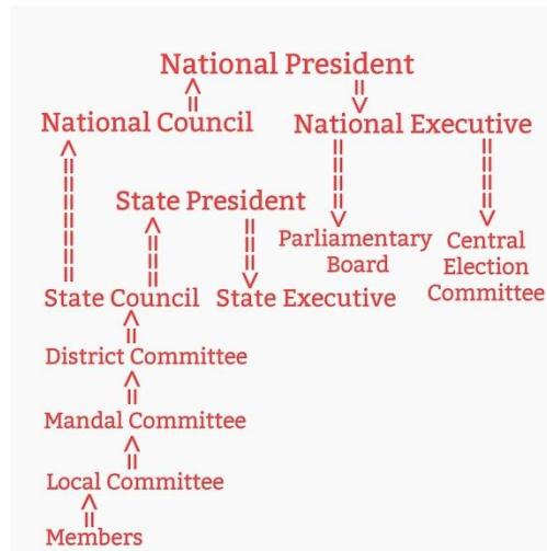
Figure 2: BJP's Organisational Structure

Moreover, the party invested heavily in social media platforms compared to the 2009 elections (Jaffrelot 2015). This new strategy comprising of change in organizational structure coupled with a disciplined orientation and extensive budget led to a successful election campaign in 2014 (Jaffrelot 2015). The organizational structure of the BJP is depicted in Figure 2.