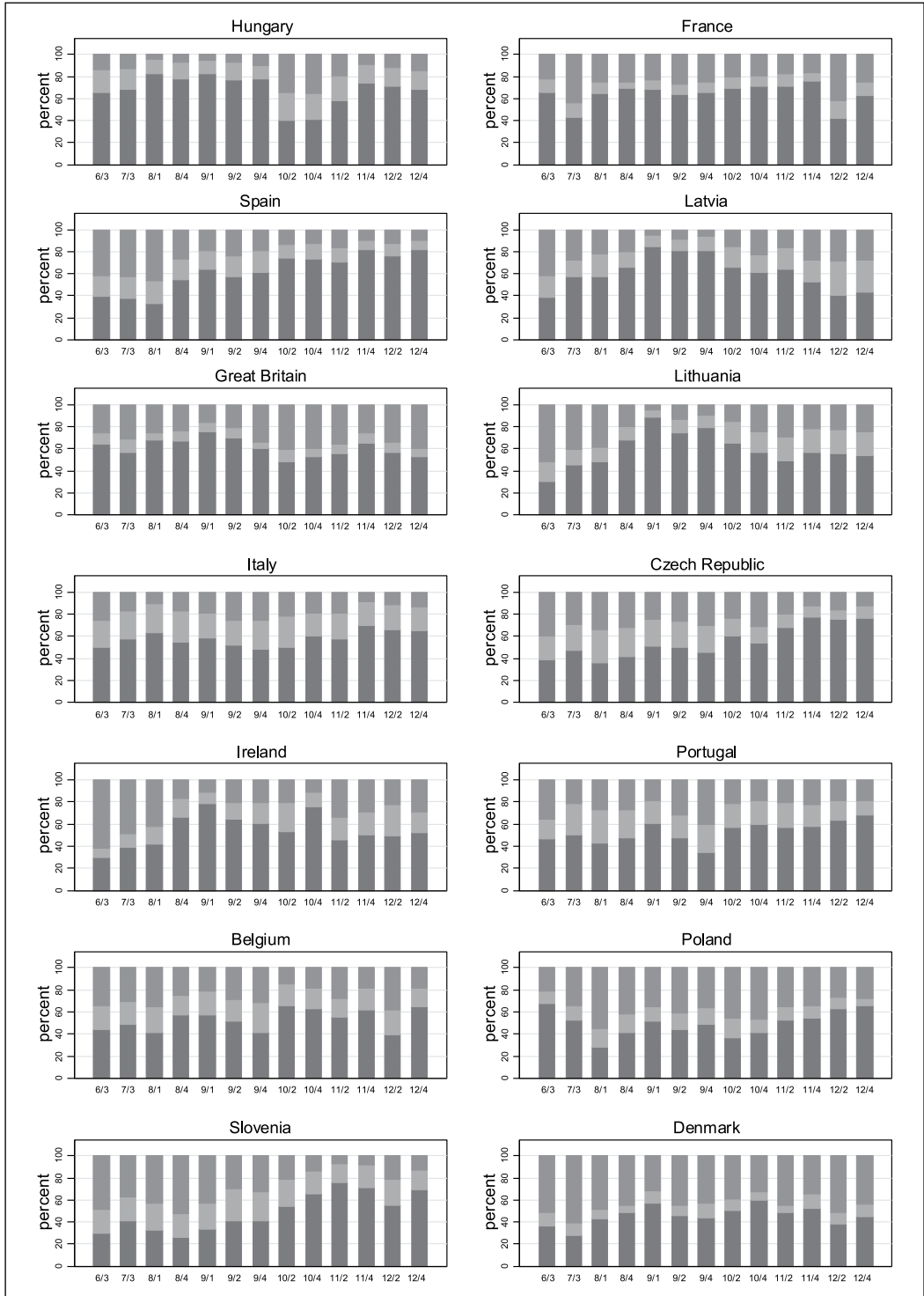
Figure 3. (continued)