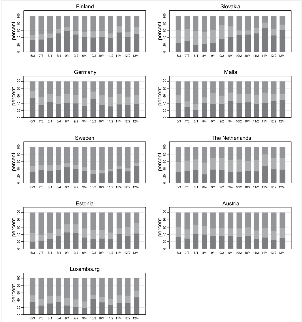
Figure 3. Within-country changes in societal pessimism 2006–2012.

( b = -0.27 ) and as a time-invariant characteristic ( b = -0.64 ). These remarkable results are quite robust when it comes to the various model specifications. 16 As a consequence, governmental instability stimulates societal pessimism, while early elections instead provide an optimistic boost.