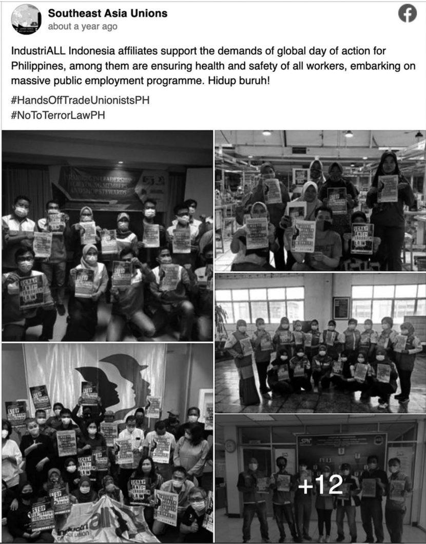
Screenshot of Global Solidarity for Jobs, Rights, Safety, and Accountability in the Philippines. Photo: ITUC (2020). https://www.ituc-csi.org/global-solidarity-philippines .