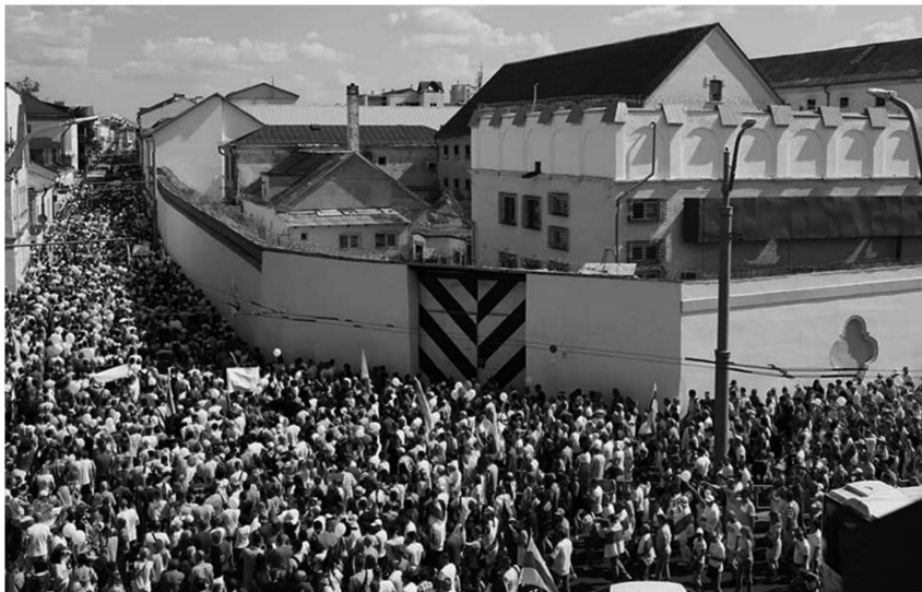
The prison in the city where the author lives, surrounded by thousands of peaceful protesters on 16 August, 2020.