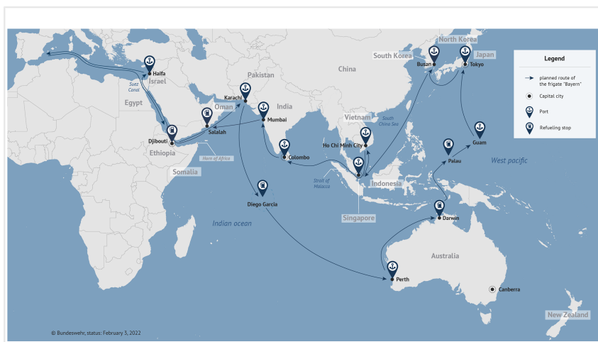
Figure 1. The Route of the Bayern

On 2 August 2021, the frigate Bayern set sail for Indo-Pacific seas. It represented one of the first and most visible steps in the implementation of Germany’s “Policy Guidelines for the Indo-Pacific” issued a year earlier. The seven-month-long journey has been conceived as a naval diplomatic and security political mission for “showing the flag” in support of “value partners” who, like-mindedly, cherish the integrity of the rules-based order. It led the Bayern through the Suez Canal to Karachi, before crossing the Indian Ocean via the joint United States–United Kingdom base on Diego Garcia to Fremantle and Darwin; to Palau and the US territory of Guam, onwards to Tokyo and Busan; and then back through the South China Sea to Singapore, Ho Chi Minh City, across the Indian Ocean to Colombo and Mumbai, before returning to the Mediterranean.