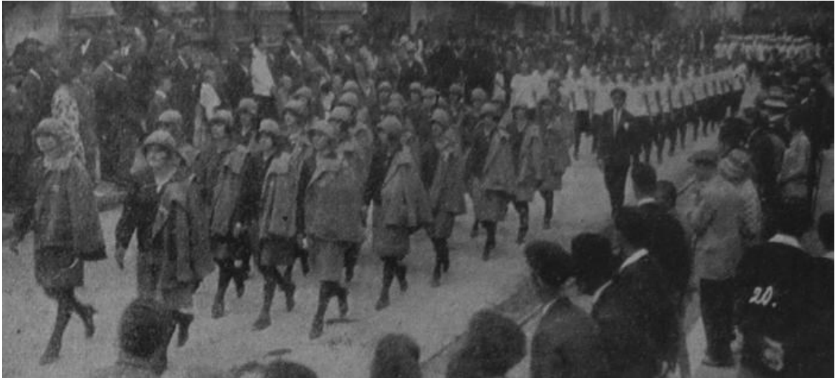
Figure 3. Croatian Sokols at a rally in Sarajevo in 1928.