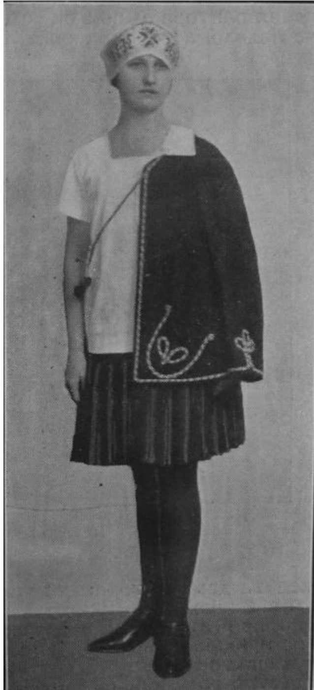
Figure 5. Sokol uniform for girls.