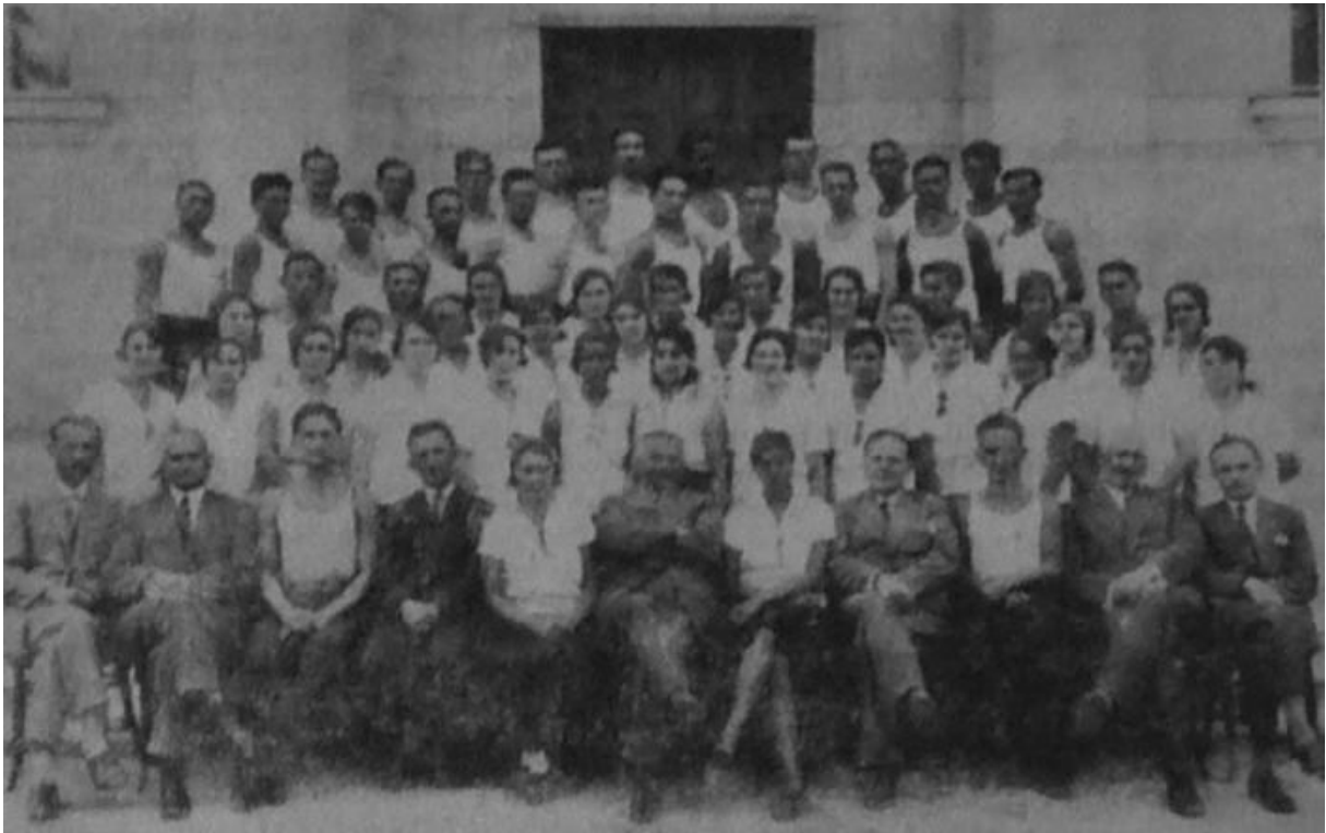
Figure 7. Attendants at an advanced-level course in Osijek, 1932. Note the gender mix in particular.