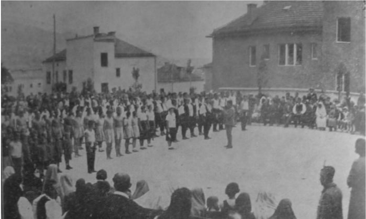
Figure 8. Public Sokol event on Prince Peter's birthday in Sarajevo, 1933. Note in particular the gender mix.