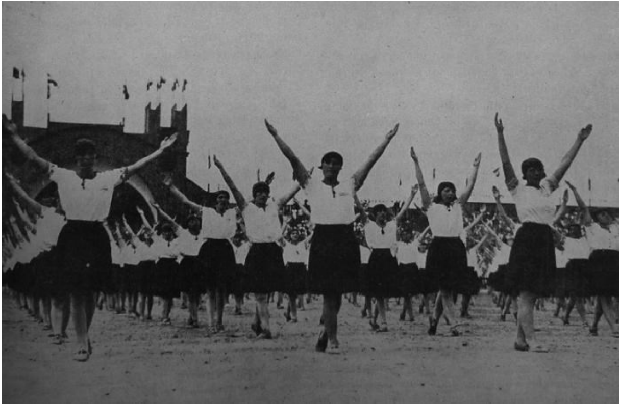
Figure 6. Sokol girls performing a simple exercise.