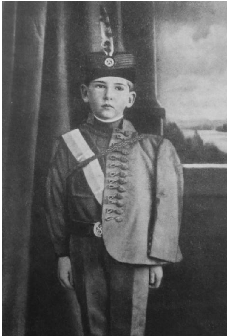
Figure 4. Prince Peter in Sokol uniform. source: Brozović, Soko , n.p.