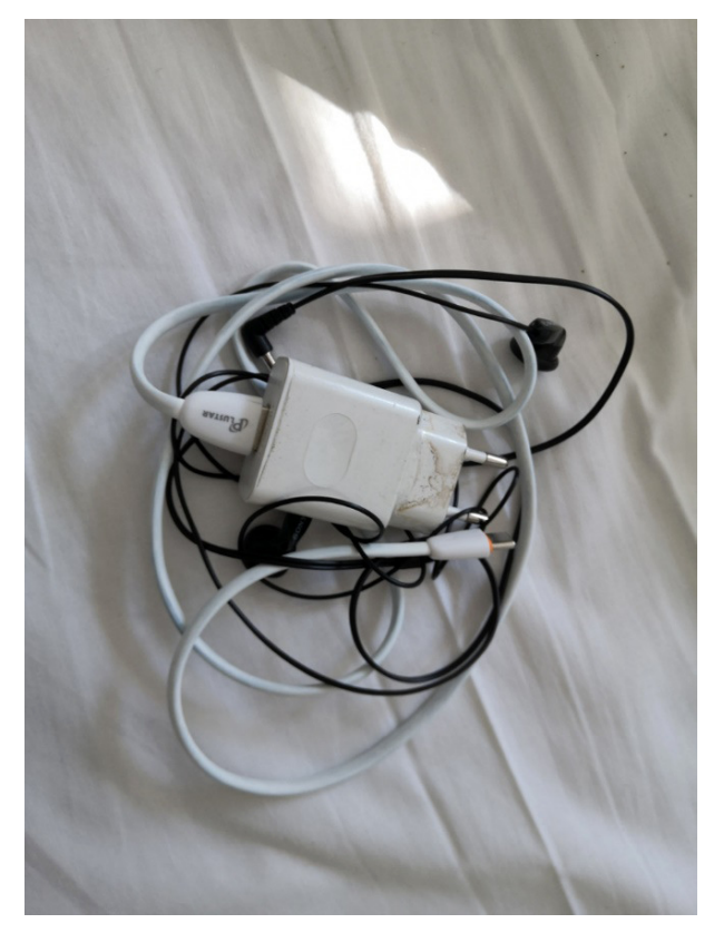
Figure 1. Small things that matter in life.

headphones always available, and this is something that now connects most people, so there was a point in picturing the device that shows us how similar we are despite differences in legal status.