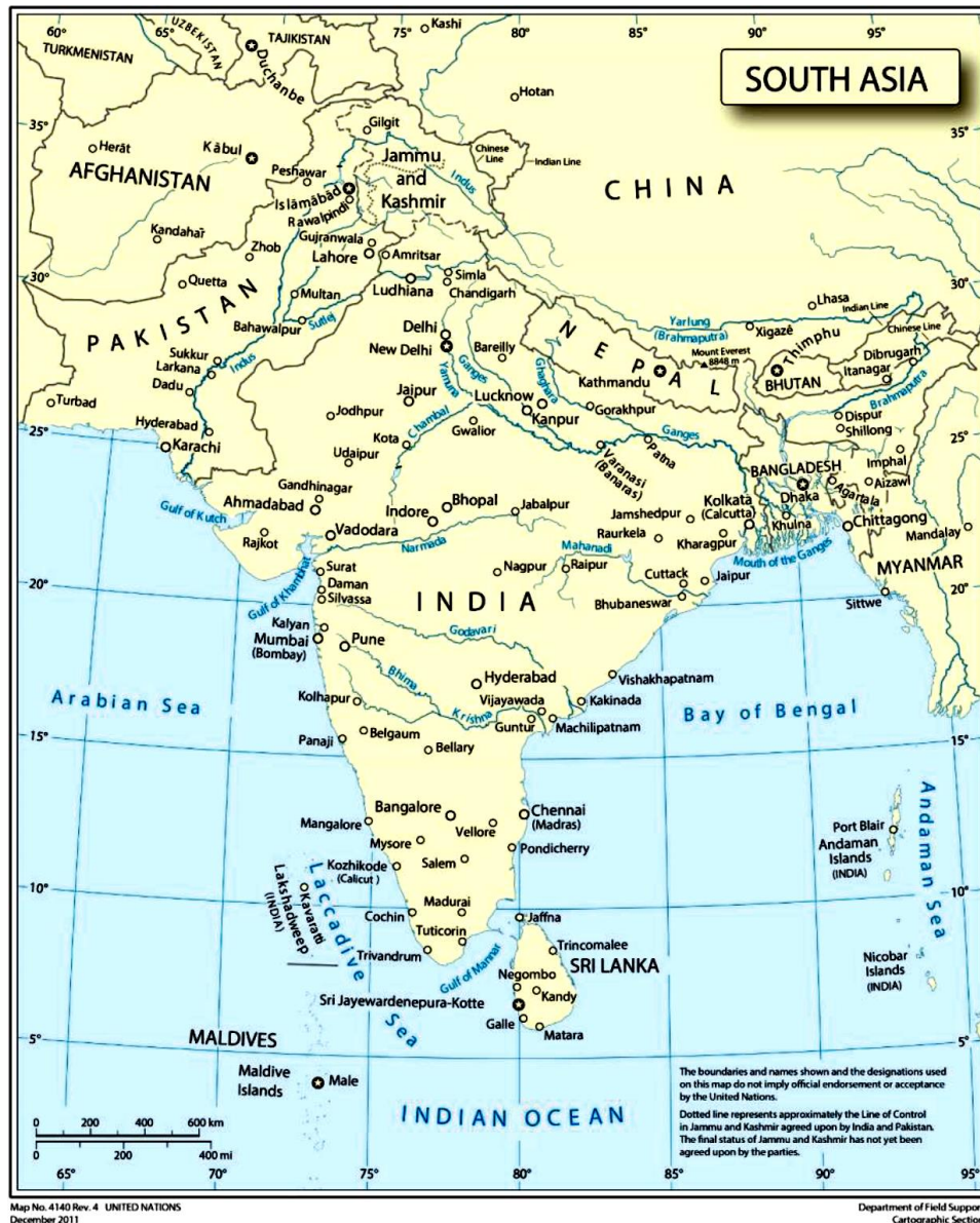
Figure 1. Map of South Asia.

such as the National Crime Records Bureau as well as international agencies like UNODC (United Nations Office on Drugs and Crime).