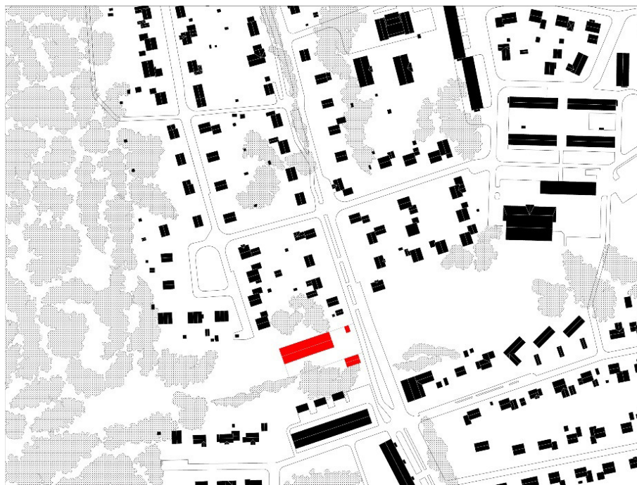
Figure 1. Fringe localization I. This figure shows the site plan over the planned accommodation of case 2. The localization is in between two existing neighborhoods surrounded by a road, a park and two residential houses. Drawing by Andrea Gimeno Sanchez.

Case 2 shows clearly how dimensions of localization as externality were played out. The process of building the new supported accommodation was abruptly aborted owing to objections from neighboring property owners, forcing the municipality to continue providing supported accommodation in the inadequate and inappropriate facilities. According to the informants, the reason for objecting was that the new accommodation presented a perceived threat to the residents in the neighborhood. One informant described the complaints as “these people can be dangerous; we cannot let our children out. So, there is a lot of lack of knowledge and prejudice. I would say that it is mostly about lack of knowledge” (case 2, manager, social services).