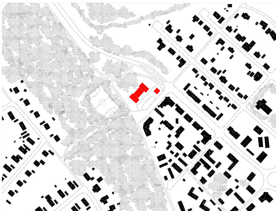
Figure 2. Fringe localization II. This figure shows the localization of the supported accommodation of case 3. Here the “insert” strategy was applied, i.e., the supported accommodation as part of a new urban development but as a free-standing construction. Drawing by Andrea Gimeno Sanchez.

The “insert” strategy was viewed by the social service as well as urban planning civil servants as an appropriate and efficient way of using land, supporting the idea of densification of sub-urban areas but also in line with ideas of localizing supported accommodations in