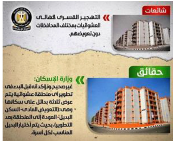
Figure 3. Official announcements to respond to rumors regarding Al-Asmarat through online channels. Note: translation—“The rumor: Forced eviction for ashwa’eyat residents without compensation. Facts: Ministry of Housing: Not true, as we confirm that before developing any ashwa’eyat area, three alternatives are offered—financial compensation, alternative housing, returning to the area after development—and the appropriate alternative is chosen for each family.”