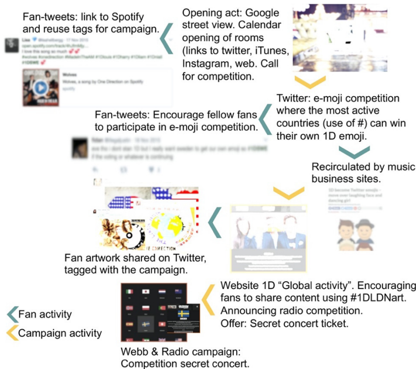
Figure 1. An example of a visual map for the One Direction marketing campaign.