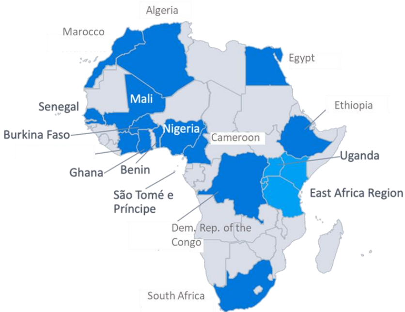
Fig. 2: Countries on the African continent where active biennials are currently held

The following overview and classification of contemporary art biennials on the African continent is based on geographic zones and follows the definitions of African regions postulated by the AU. 9