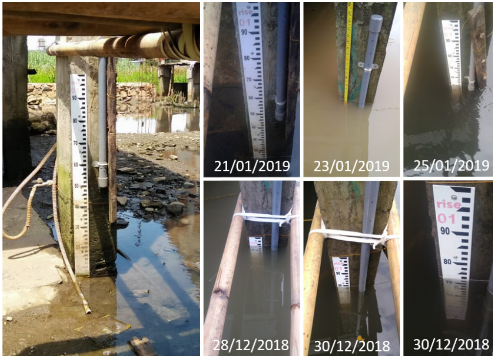
Figure 1. Flood gauge in Makassar, Indonesia, photographed by residents in different conditions during floods in 2018 and 2019.

The preparation for the project consisted of the installation of a gauge and a crest level indicator in each of the flood-prone settlements in a position where the participants could safely photograph the gauges and register water level fluctuations. The participants were instructed to use their personal smartphones to send photos of the flood gauges daily (see Figure 2) in order to keep a record of the water levels throughout the whole season. The RISE staff members that engaged the communities instructed the participants to photograph the