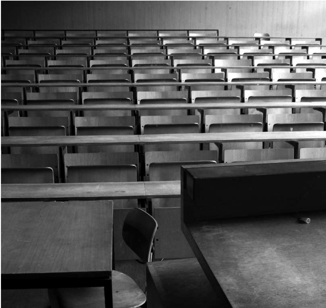
A panoptic powerstructure

task or a particular form of behavior must be imposed, the panoptic scheme may be used" (Foucault 1991: 205). Foucault's primary examples of panoptic power relations are prisons, factories, schools, barracks, and hospitals. The democratically controlled watch-tower aims not at a negative disciplinary power, but exists in order "to strengthen the social forces – to increase production, to develop the economy, spread education, raise the level of public morality; to increase and multiply" (Foucault 1991: 208).