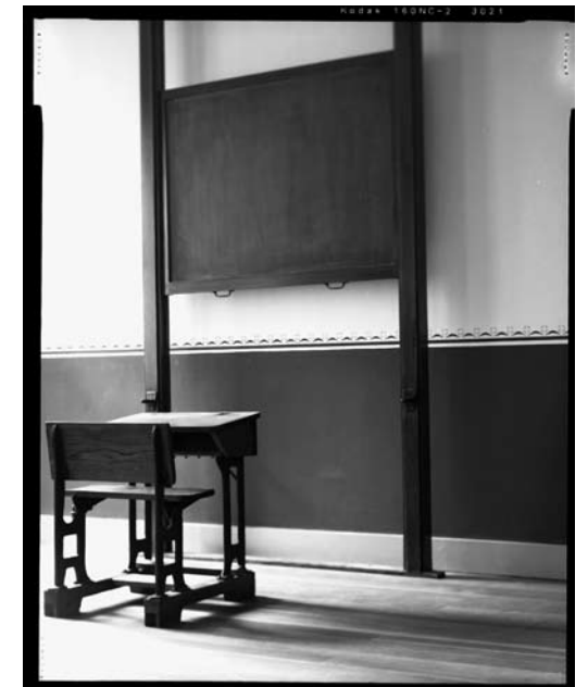
A place of creation

So what can we learn from Foucault with regard to the question of power? The perfect power finding its ideal form in the Benthamite panopticon was established through a historical process at the very foundations of the modern société disciplinaire we are currently living in. Rousseau's Contrat Social with its sovereign and its according conception of power only plays a minor part in the theatre of modernity