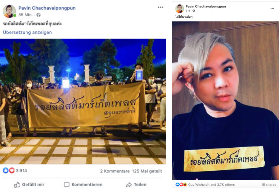
Figure 1 (left). A banner with logo of the Royalists Marketplace at a democracy demonstration in Ubon Ratchathani on 19 July 2020. (Photo taken from the Facebook account of Pavin Chachavalpongpun).

The spectacular success of the Royalists Marketplace, its ban in Thailand, and the reaction of Facebook are watershed events in the development of social media in Southeast Asia, and globally. These incidents also mark a turning point in the power relation between the de-facto social media monopolist of Facebook, the new authoritarian governments that have spread around the world (Einzenberger & Schaffar, 2018), and social movements contesting these regimes in the wake of the COVID-19 crisis.