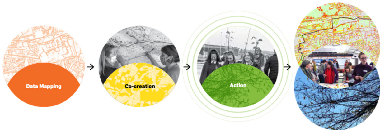
Figure 1. MGD project structure.

to the community recommendations from the co-creation stage. A community-based urban greening strategy was created and included a set of pathways to enhanced greening at neighbourhood level.