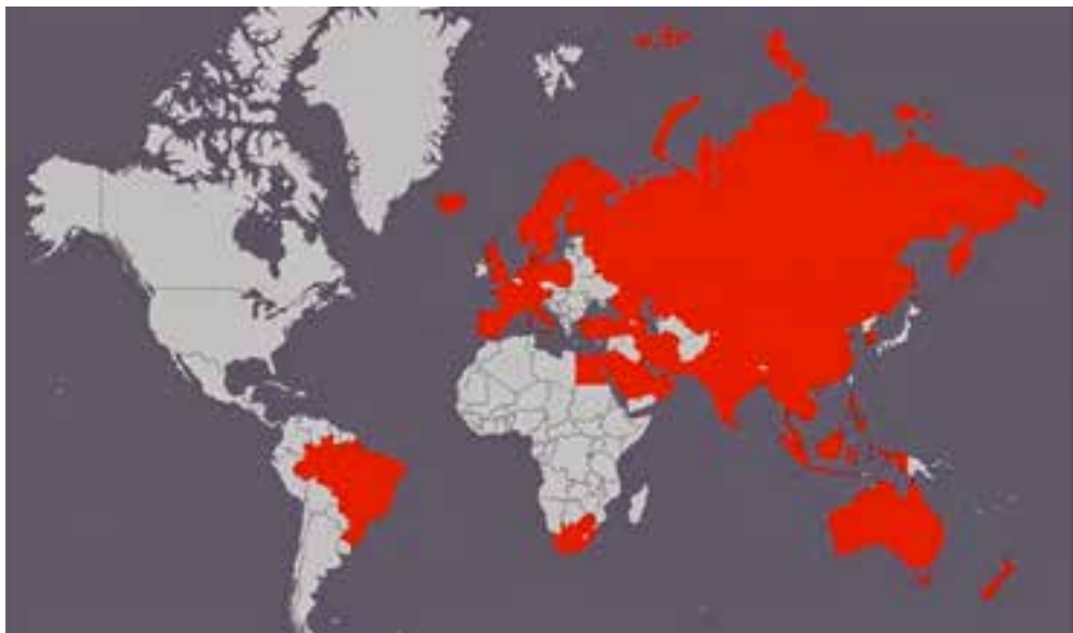
Figure 3. The Range of Member States Covered in the Asian Investment Bank Led by China