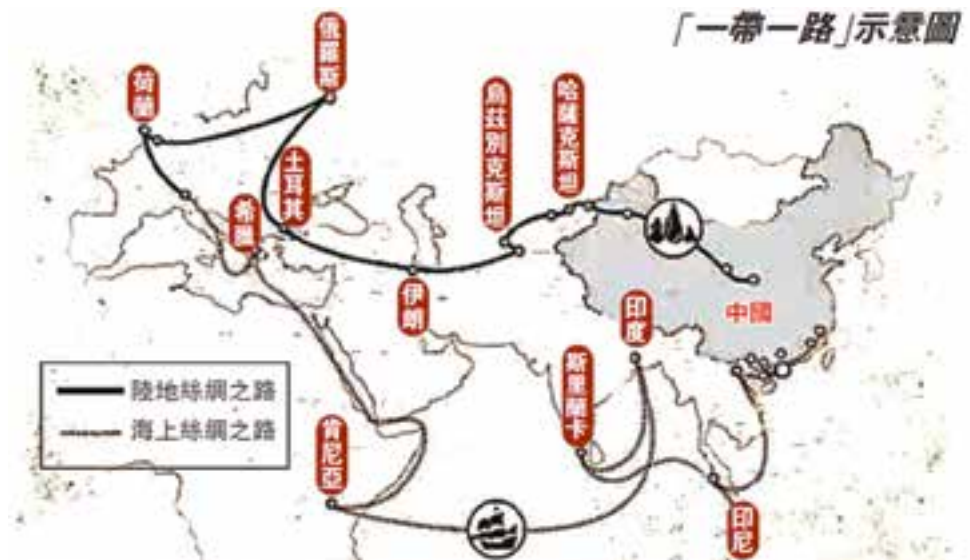
Figure 4. China’s One Belt One Road Plan

As mentioned above, international relations after World War II were mainly affected by the United States’ way of thinking. In the era when the world was dominated by European powers, classical geopolitics was once an important ground that influenced the power houses’ decision. Among them, the British geopolitics scholar Halford John Mackinder at the London conference of the Royal Geographical Society in 1904, proposed the “heartland theory” that any country which can control Eurasia would be able to control the whole world. Of course, the era in which the land power geopolitics was put forward was completely different from what it is now. The land power geopolitics at that time was completely broken by the British and American sea power.