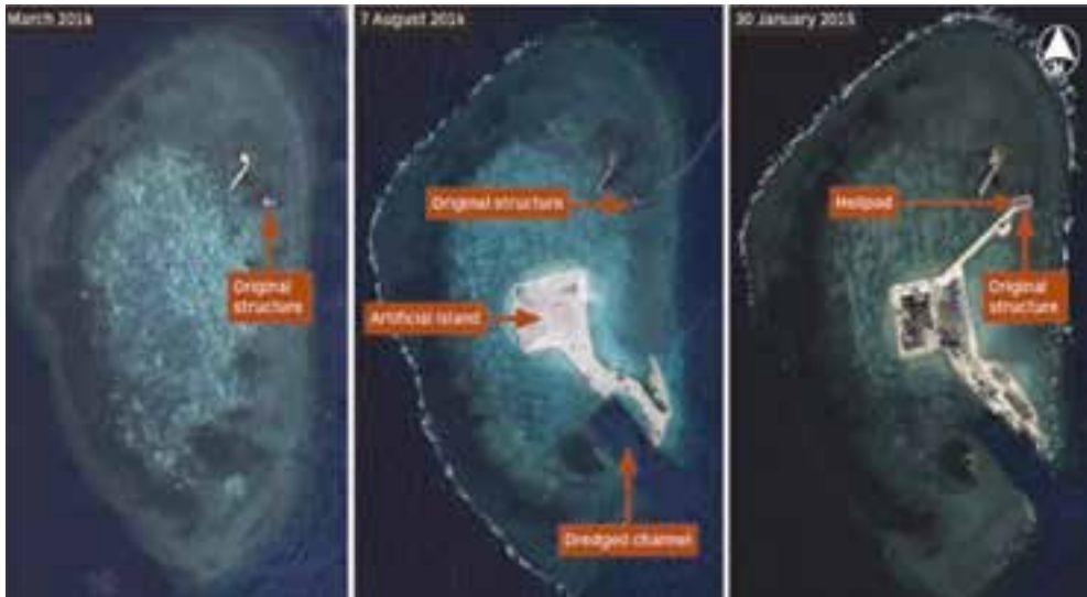
Figure 7. French Newspaper Le Figaro Published the Procedure of Creating China's Sovereignty