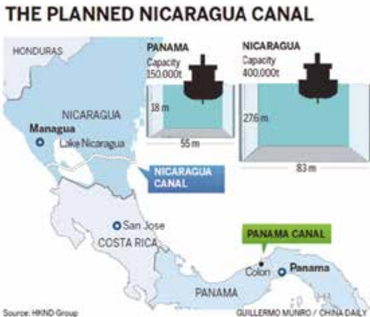
Figure 6. The Nicaragua Canal Constructed in 2014 Will be Able to Accommodate Larger Cargo Ships

At that time, China’s investment plan cooperation with Nicaragua is expected to provide 50,000 career opportunities and the investment of over 50 billion dollars [Collet, 2014]. Nicaragua is Taiwan’s official political ally so China’s substantial investment outlay should be expected there. If China has any knowledge of the plans of Taiwan’s government, it will try at any time to ask Nicaragua to break off diplomatic relations with Taiwan and establish official diplomatic relations with China. At the same time, the United States has been concerned about China’s establishing a canal project in their backyard [BBC, 2015]. There is no doubt that the international political observers generally regarded this project as a challenge to the U.S. interests in the Pacific [LR, 2015]. Some experts even predict that Nicaragua Canal would become a major road for China’s warships to cross the Pacific to the Atlantic routes, not necessarily through the Panama Canal which is controlled by the U.S. In any case, with the project of constructing the canal in 2019, it could be imagined that the United States will face taking shape of China’s geopolitical strategy of intervention into the Pacific order.