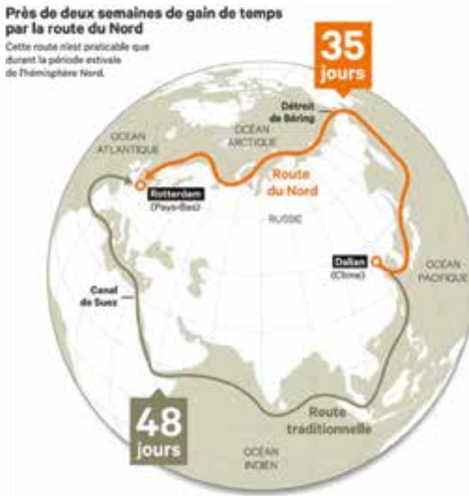
Figure 5. New Arctic Waterways Which Shortened the Sail to 12 Days

2012, China and Iceland signed a cooperation agreement that included six items regarding the Arctic, navigation and science [LP, 2012]. In 2013, China and Iceland signed a free trade agreement, hoping to strengthen its economic partnership with Iceland [LE, 2013a]. In fact, an attempt by China to strengthen the relations with Iceland to construct future Arctic waterways has been carried out on a daily basis [NYT, 2013].