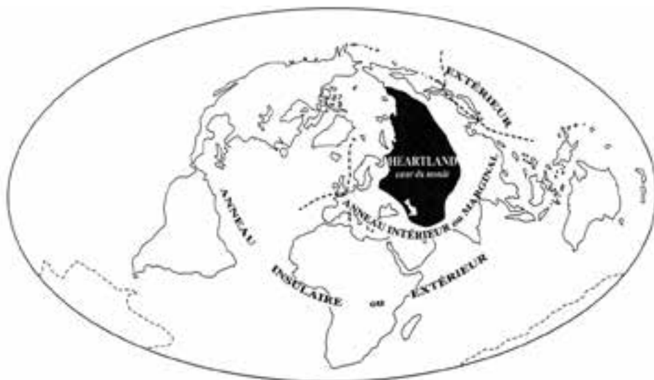
Figure 1. Mackinder's Heartland Theory Published in 1904

true, the British Empire's sea power will be destroyed 4 . Thus, Mackinder's Eurasia heartland geopolitical theory just reflected and theorised the British geopolitical foreign policy in Europe.